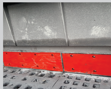
Screen Side Wear Liners