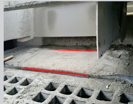
Screen Feed Box Liners