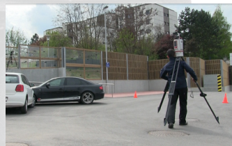
move the scanner to the next scan position