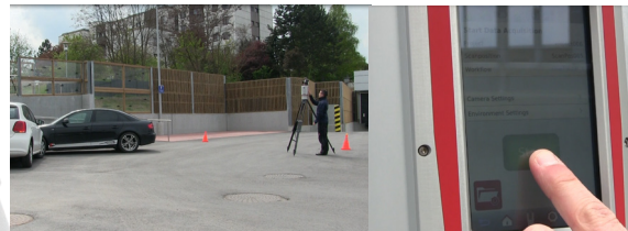
to start the next scan, just press the START-button