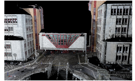
automatically cleaned-up point cloud