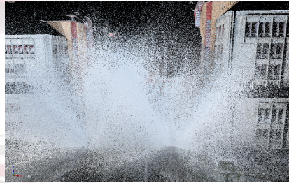
point cloud before filter application