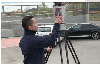
select the appropriate scanning parameters and start the first scan

Several pre-defined data acquisition workflows (e.g. Default, Forensics, OneTouch) are available. These pre-defined workflows allow the operation of the scanner by pushing just one icon on the screen per scan position. Once the tripod is re-arranged, a new scan position will automatically be generated. Modifications or creations of individual workflows to meet user specific requirements are also possible.