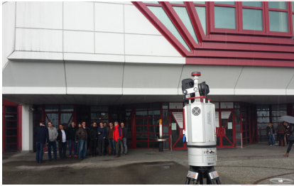
scanning in the rain

Using deviation and reflectance filters, range measurements caused by rain drops, dust or haze can be identified, selected, and deleted, resulting in a clear and clean point cloud of the relevant scene.