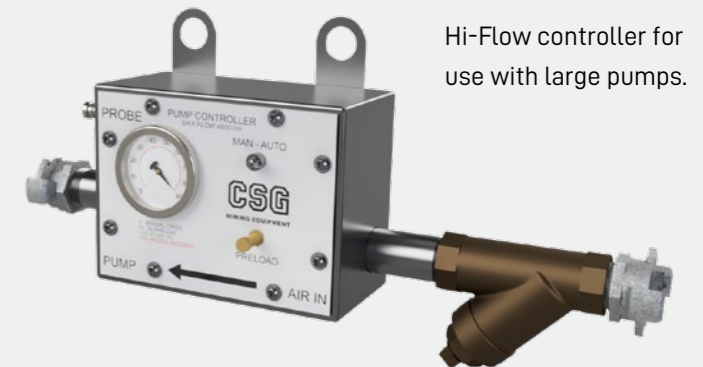
Hi-Flow controller for use with large pumps.

The energy cost of a pump without a controller fitted is approx. $6,161 per year. With approx. 84% reduction in running time, energy costs for a pump fitted with a controller is estimated at $985 per year. This represents an annual saving of $5,193 in energy costs for each pump fitted with a CSGME Air Pump Controller.