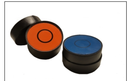
Magnetic Susceptibility Calibration Pads