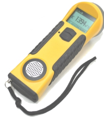
KT-10 v2 Magnetic Susceptibility Meter (Circular Coil)