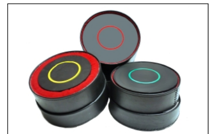
Conductivity Reference Pads