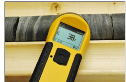
KT-10 Plus v2