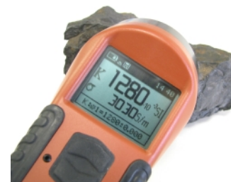
KT-10 S/C (Circular Coil)