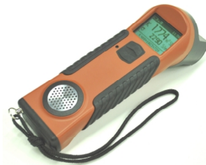
KT-10R S/C Magnetic Susceptibility/Conductivity Meter (Rectangular Coil)