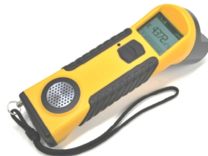
KT-10R v2 (Rectangular Coil)