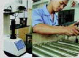
↓ Hardness test