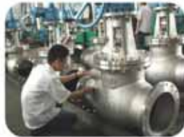
↑ Iron pollution test