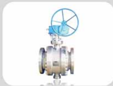
Trunnion ball valve