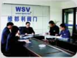
↓ Contract evaluation