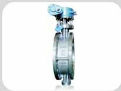
Alloy 20 butterfly valve