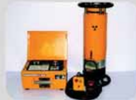
↓ X-ray flaw detection test