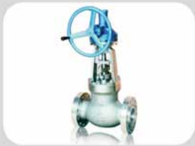
Pressure seal globe valve