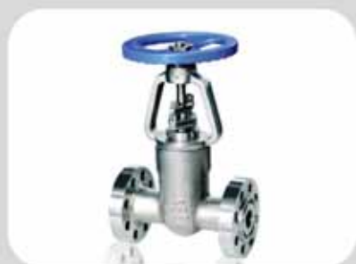
Pressure seal gate valve