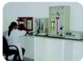
↑ Chemical analysis