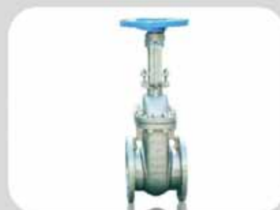
Titanium gate valve