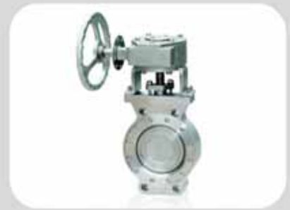
Wafer type butterfly valve