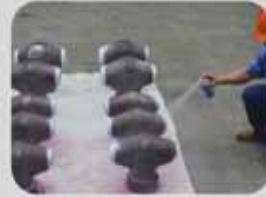
↓ Liquid Permeate test