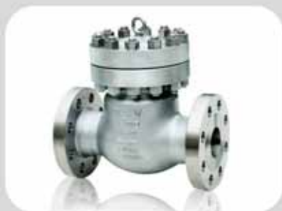
Titanium swing check valve