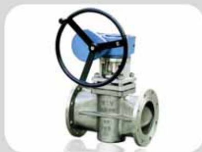
Titanium plug valve