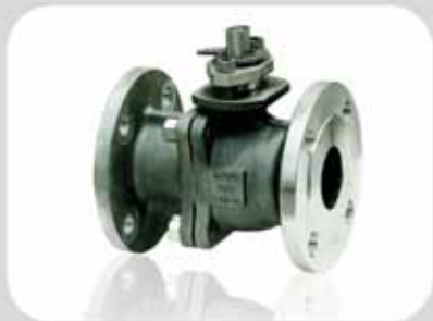
Floating ball valve