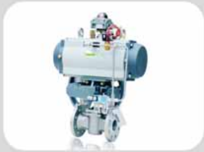
Duplex plug control valve