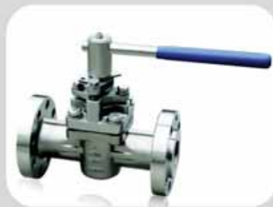
Double gland plug valve