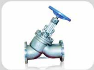
Y pattern globe valve