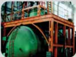
↓ Vacuum foundry