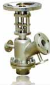
Jacketed discharge valve