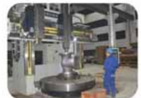
↑ Vertical lather machining