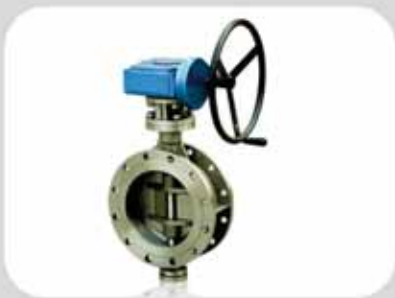
Triple offset butterfly valve