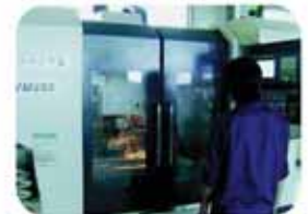
↑ Machining center