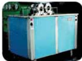
↑ Ultrasonic cleaning