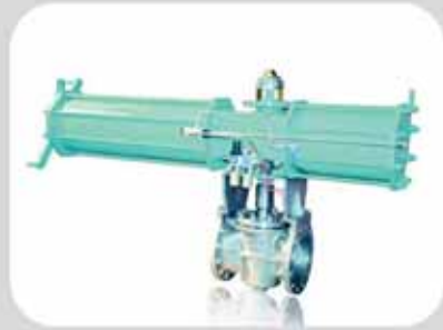
904L plug control valve