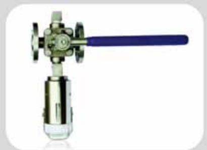
Hastelloy sample valve