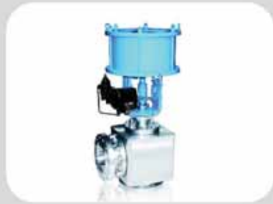
Special control valve