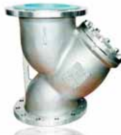
Duplex Y strainer