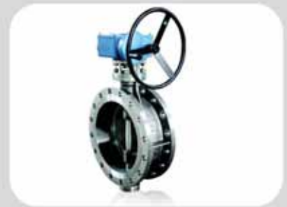
Flanged type butterfly valve