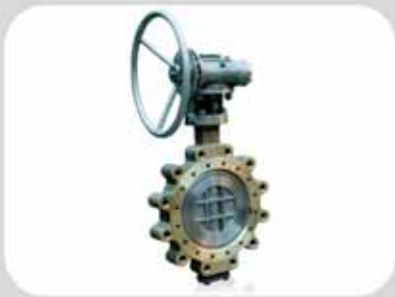
Ni-Al-Br C95800 butterfly valve