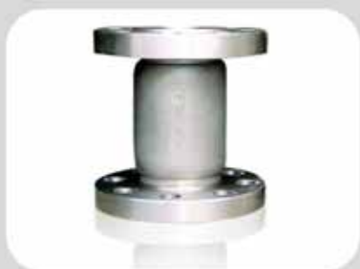
904L vertical check valve