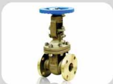
Ni-Al-Br C95800 gate valve