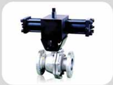
Titanium butterfly control valve