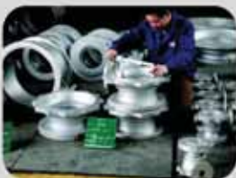
↓ Incoming inspection