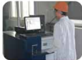
↑ Direct-reading spectrometer