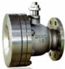
Ball type discharge valve