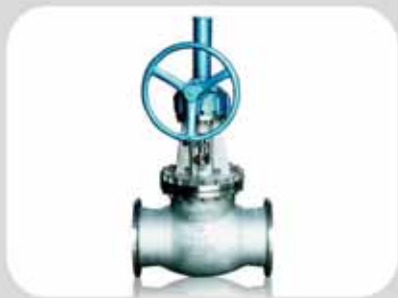
Large size globe valve