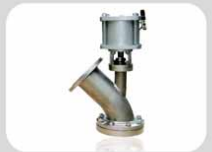
Discharge control valve