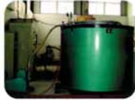
↑ Vacuum heat treatment