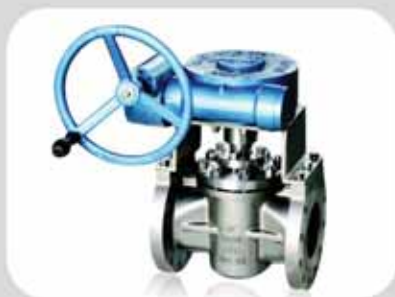
904L plug valve