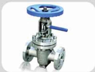
Piston plug valve