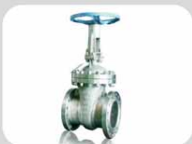
904L gate valve