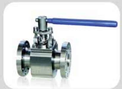
Zirconium plug valve