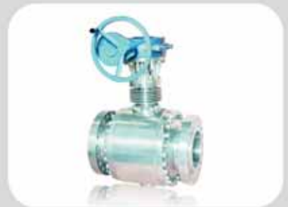
High temp ball valve