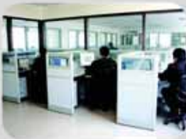
↓ Product design