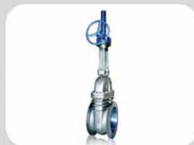
Large size gate valve