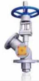
Open upward discharge valve