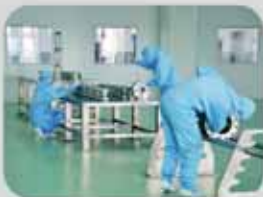
↓ Cleaning room