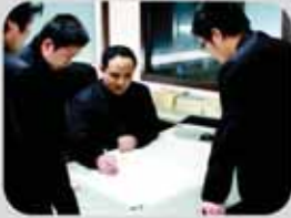
↓ Design evaluation