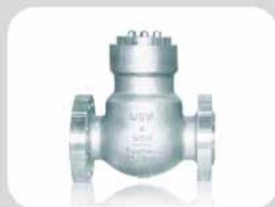
Pressure seal check valve