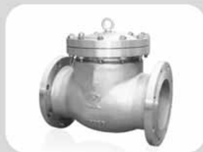
Hastelloy swing check valve