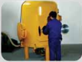
↓ Vacuum welding