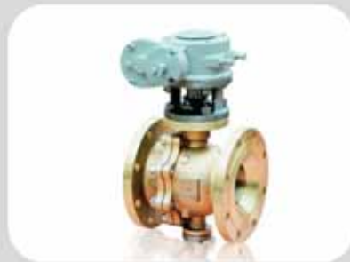
C95800 ball valve