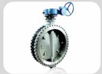
Lug type butterfly valve