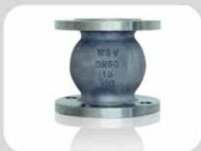
Pure nickel vertical check valve