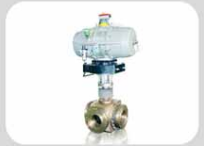
3-Way control valve