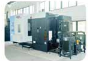
↑ CNC machining