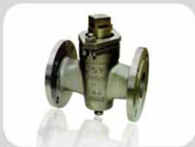
Metal sealing plug valve