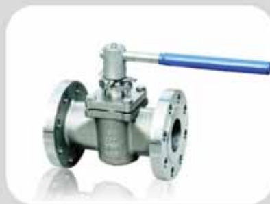
Lockable plug valve