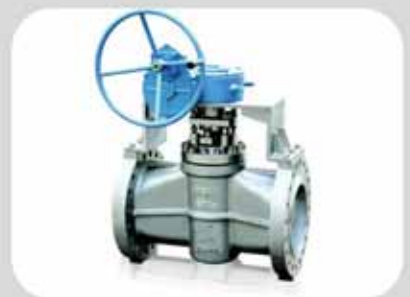
Trunnion plug valve