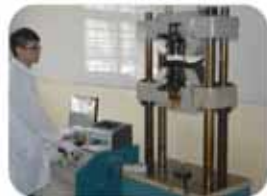
↑ Mechanical test