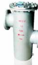
Titanium basket strainer