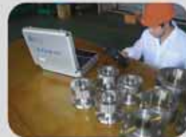
↓ Ultrasonic non-destructive inspection