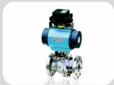
Zirconium ball control valve