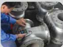
Wall thickness test