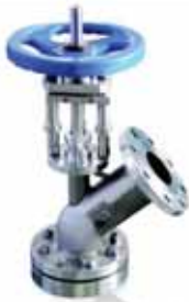
Hastelloy discharge valve