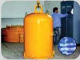
↓ Vacuum hardness treatment