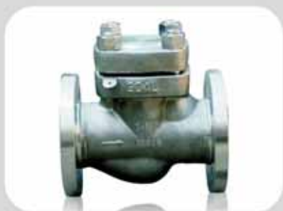
Lift check valve