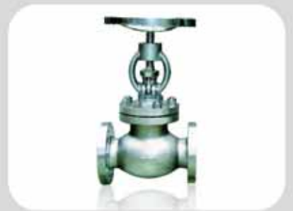
904L globe valve