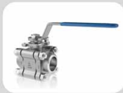
3-PC ball valve