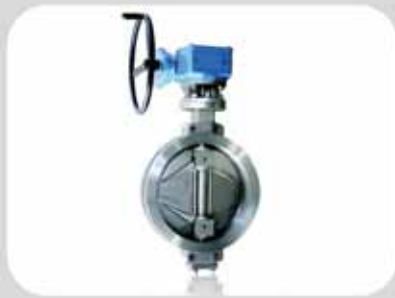
Double offset butterfly valve