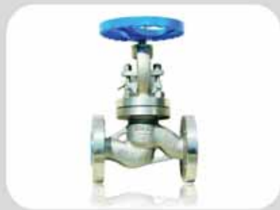
Monel globe valve