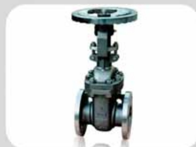
Duplex gate valve