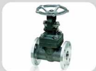
API 602 gate valve