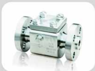
Zirconium swing check valve