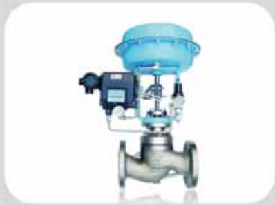
Titanium globe control valve