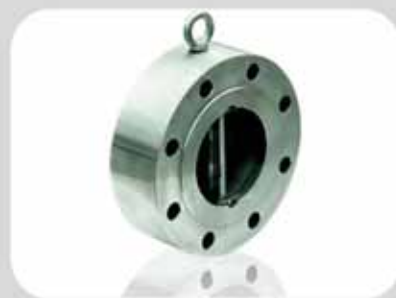
Retaineriess check valve