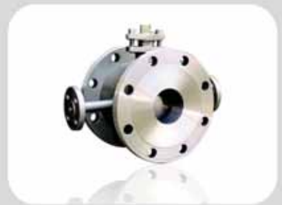
Jacketed ball valve