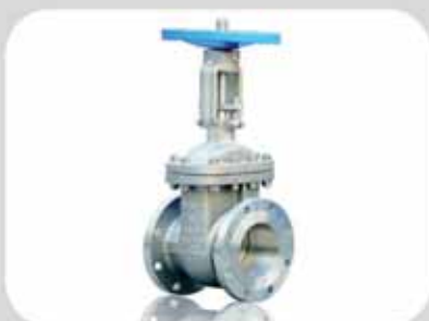
API 600 gate valve