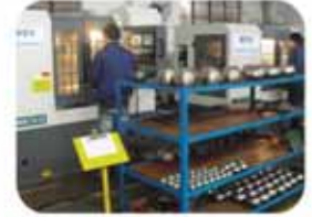
↑ CNC grinding ball