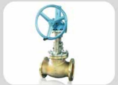
Ni-Al-Br C95800 globe valve