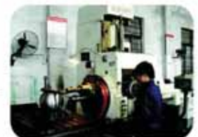
Boring machine machining