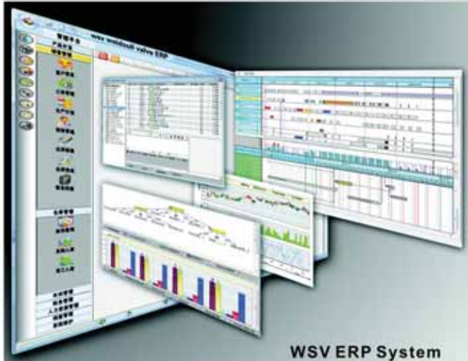
WSV ERP System

Weidouli valves complete production process from start to finish: design, manufacture, test and sale, products are tested rigorously and certified for quality assurance, is carried out with safe highest quality and to be one of global best corrosion resistant valve manufacturer in mind.