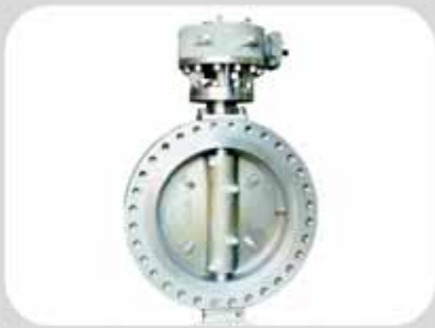
Large size butterfly valve