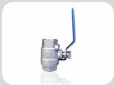
2-PC ball valve