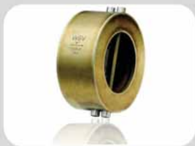
Dual plate check valve