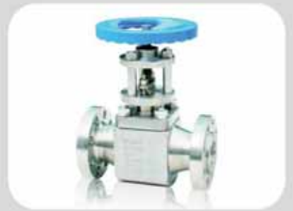
Zirconium globe valve