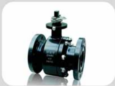
Zirconium ball valve