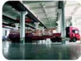
↑ Packing & shipment