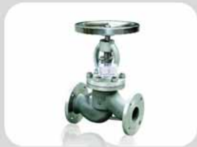
DIN globe valve