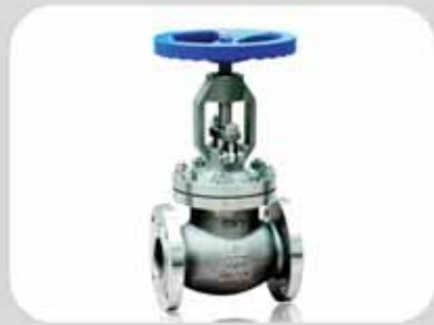
ASME globe valve