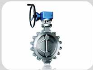
Hastelloy butterfly valve