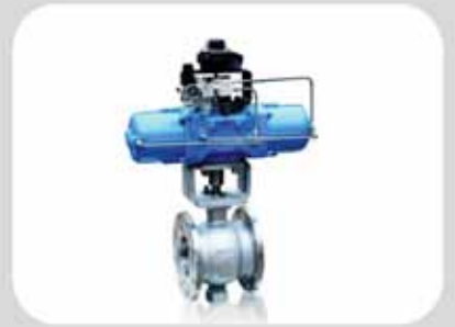
Titanium V-ball control valve