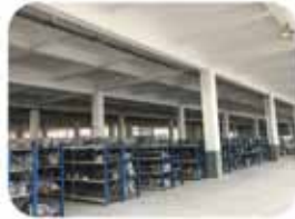
↑ Finished products warehouse