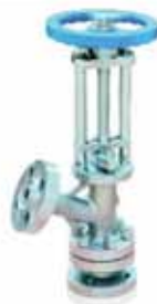
Open downward discharge valve