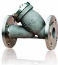
Pure nickel strainer