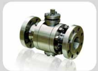
Metal seated ball valve