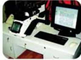
↑ Metallographic analysis