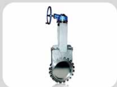
Titanium knife gate valve