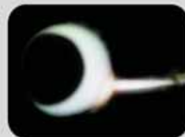
↓ Supersonic spray