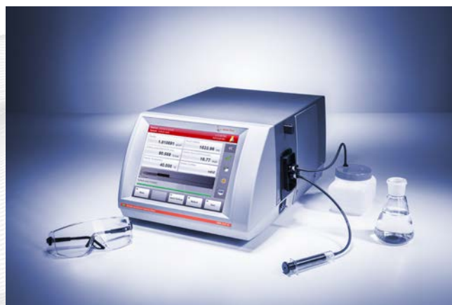
Figure 2: Filling DSA 5000 M with a glass syringe

Tip: Inserting the glass tip of the syringe directly into the inlet adapter of DSA 5000 M may result in the fracture of the tip due to applied inappropriate pressure. Do not insert the syringe directly into a Teflon adapter, use a small piece of viton hose between the syringe and DSA 5000 M instead (see Figure 2 ).