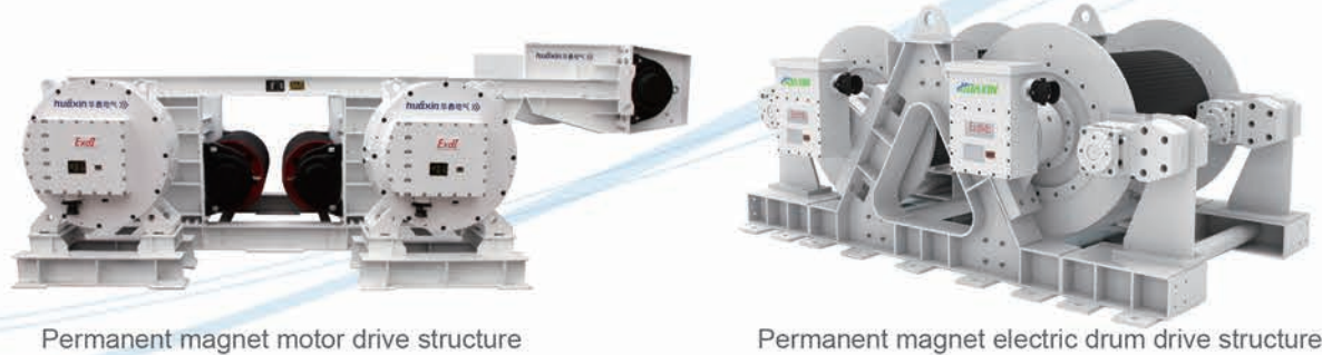
Permanent magnet motor drive structure