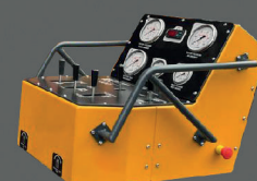
New Control Unit

Safe and fast rod handling Simple and reliable chuck very few moving parts. Double feed cylinders. For quick rod handling at all depths. Drill in any direction.