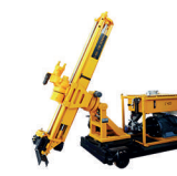
Electric Motor - Wheeled Total Weight : 2.750 kg