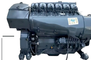
6 Cylinder Diesel Engine