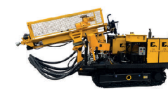
Drilling Rig Electric Motor Walking System Diesel Engine Total Weight : 4.900 kg