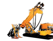
Electric Motor - Skid Frame Total Weight : 2.750 kg