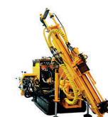
Complete Diesel - Crawler Total Weight : 4.900 kg

Safe and fast rod handling Simple and reliable chuck very few moving parts. Double feed cylinders. For quick rod handling at all depths. Drill in any direction.