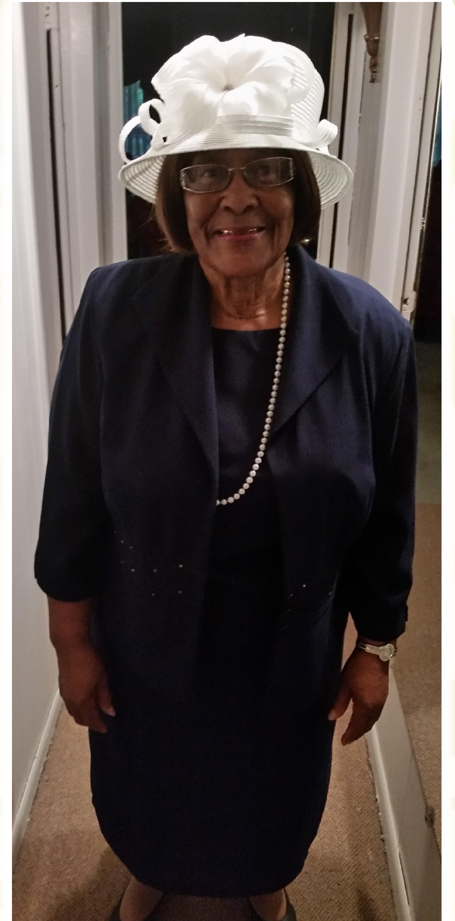
Gone, But Not Forgotten