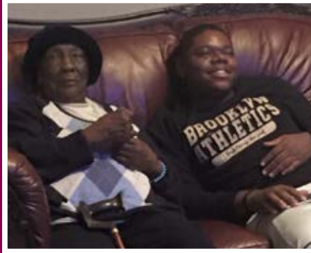
Gone, But Not Forgotten