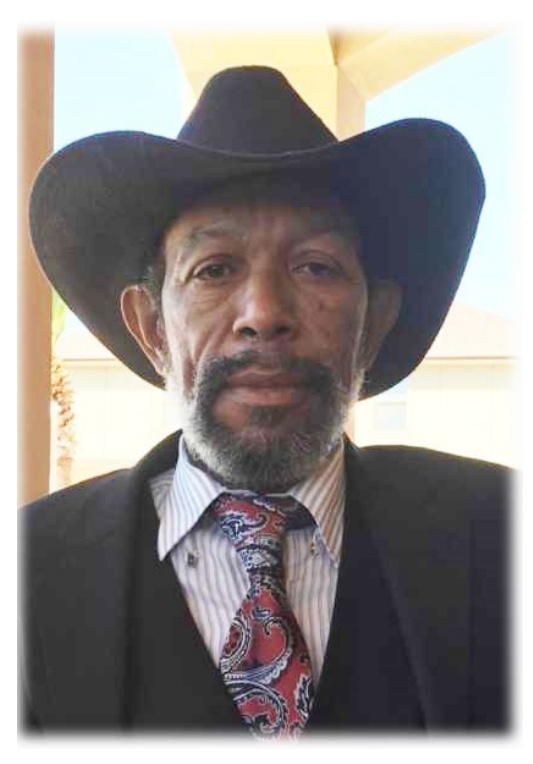
~ Graveside Services~ WEDNESDAY, SEPTEMBER 29, 2021 AT 11:00 A.M.

ALLEN CHAPEL CEMETERY ALLENDALE, SOUTH CAROLINA 29810