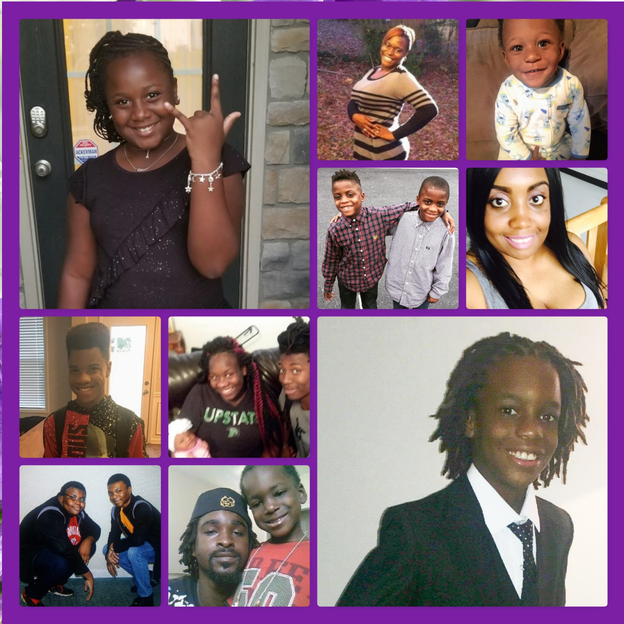
We cherish the Memories you SHARED with us