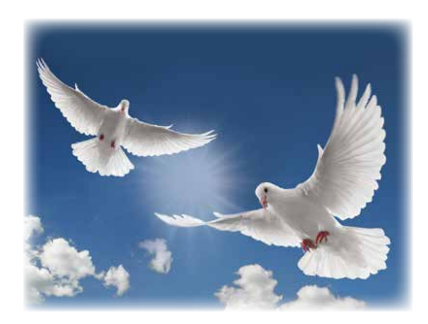
Enloe Mortuary "Sympathetic and Efficient Service Since 1922" 231 North Lafayette Street Shelby, NC 28150

I care not what his temples or his creeds One thing holds firm and fast That into his fateful heap of days and deeds The soul of man is cast.