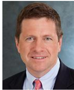
Chairman Jay Clayton Term Ends 2021