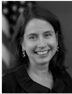
Kara Stein (D) Term Ended 2017*