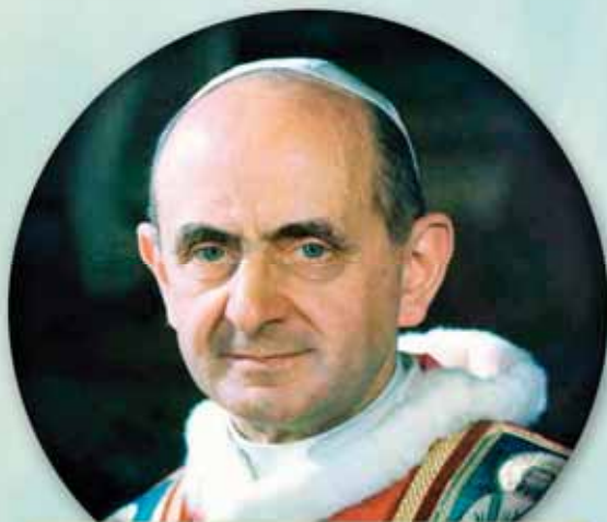
Saint Pope Paul VI