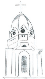
SAINT PATRICK 404 E. Main St.