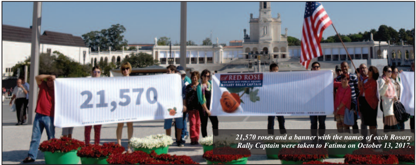
21,570 roses and a banner with the names of each Rosary Rally Captain were taken to Fatima on October 13, 2017.

In his book, The Secret of the Rosary , St. Louis Marie De Montfort said while exhorting sinners everywhere, “I, a greater sinner than you, wish to give you this rose—a crimson one, because the Precious Blood of Our Lord has fallen upon it.”