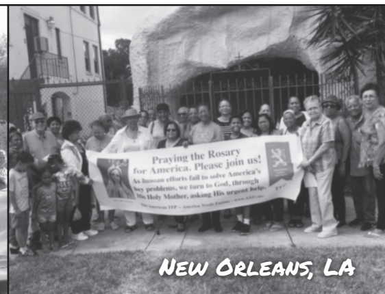
NEW ORLEANS, LA