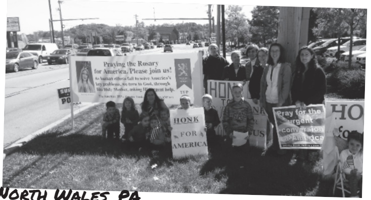
NORTH WALES, PA