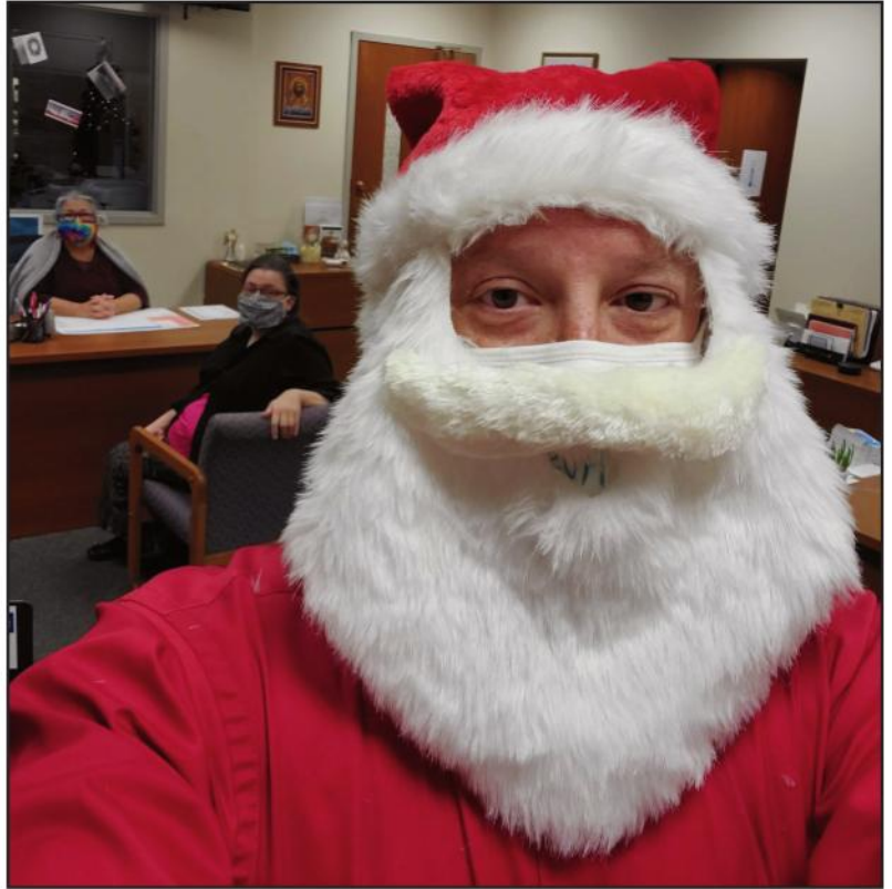
Thank you Santa for stopping by the parish office and taking a selfie with us. Merry Christmas!