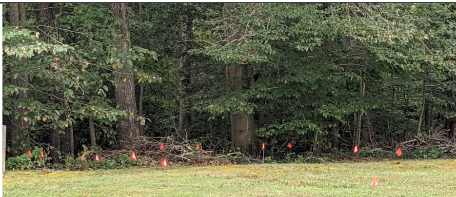
Flags mark the graves discovered by the survey.

After years of dreaming about it, we finally this week undertook a radar survey of our old cemetery at St. Ignatius. There are many unmarked graves there stretching back to the mid-1800s. We hired a company to do a survey with ground penetrating radar machine to identify all the graves,