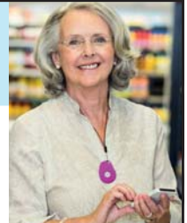
GPS Mobile Above

No Contract • No Fees • Easy Setup • md-medalert.com CALL 800-890-8615