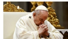
The Pope's Prayer Intention for June: Families

Fiat Girl's Retreat: July 13-15, 2022 "Fiat" is the Latin phrase for "let it be done". The Fiat Retreats offer guidance and time in prayer, as well as classic camp activities like sports, hiking, swimming and great food. You will have the chance to meet and hang out with religious sisters, who serve as group leaders and help run the retreat. More info or register here: dsj.org/fiat/