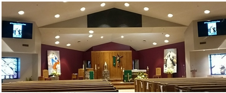
26 th SUNDAY IN ORDINARY TIME