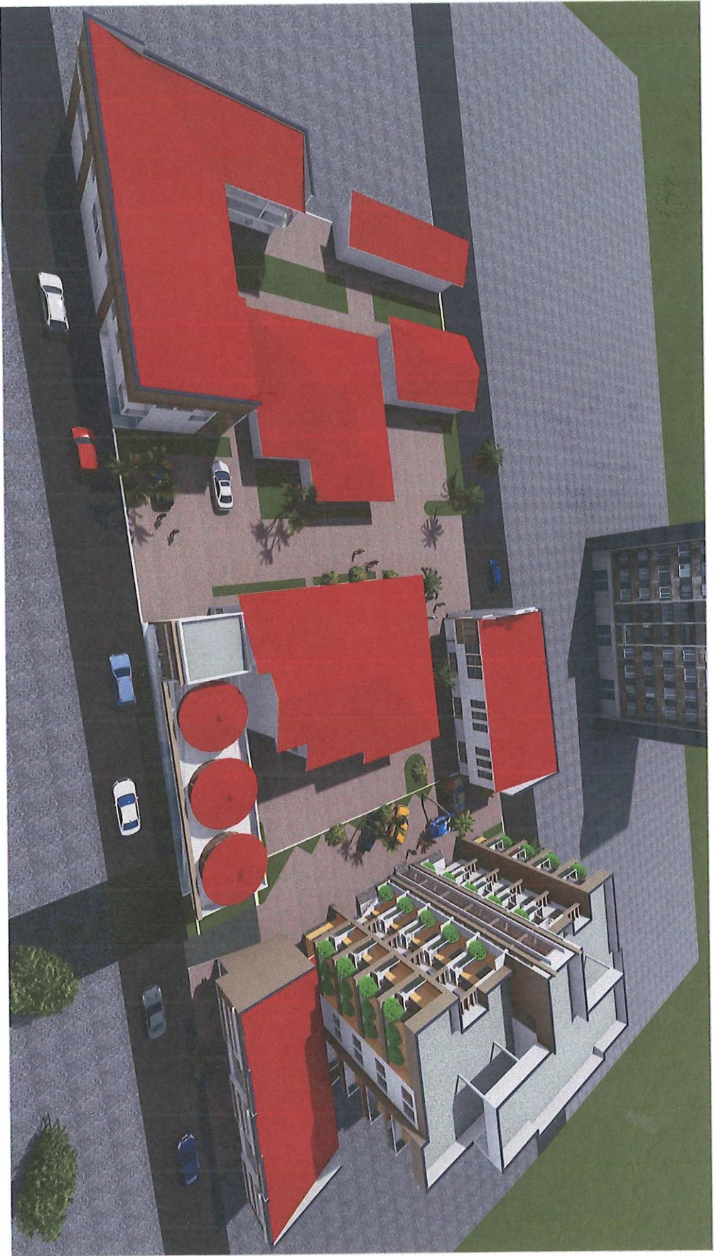
PERSPECTIVE VUE D'ENSEMBLE