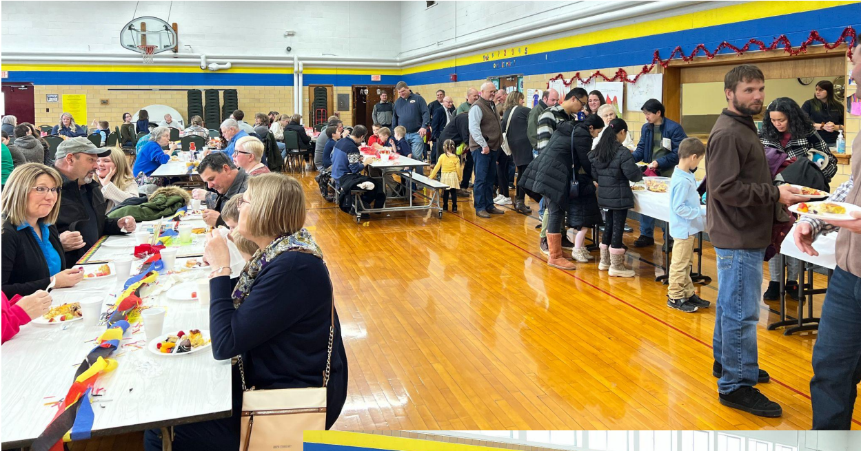
Look at this awesome crowd! It's pretty amazing that we get to share in fellowship with generations of St. James