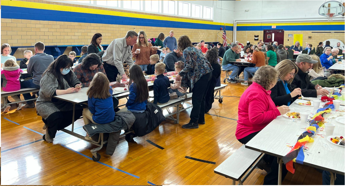
Students and staff enjoyed listening to alumni share about their