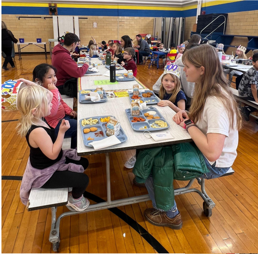
The high schoolers ate with students