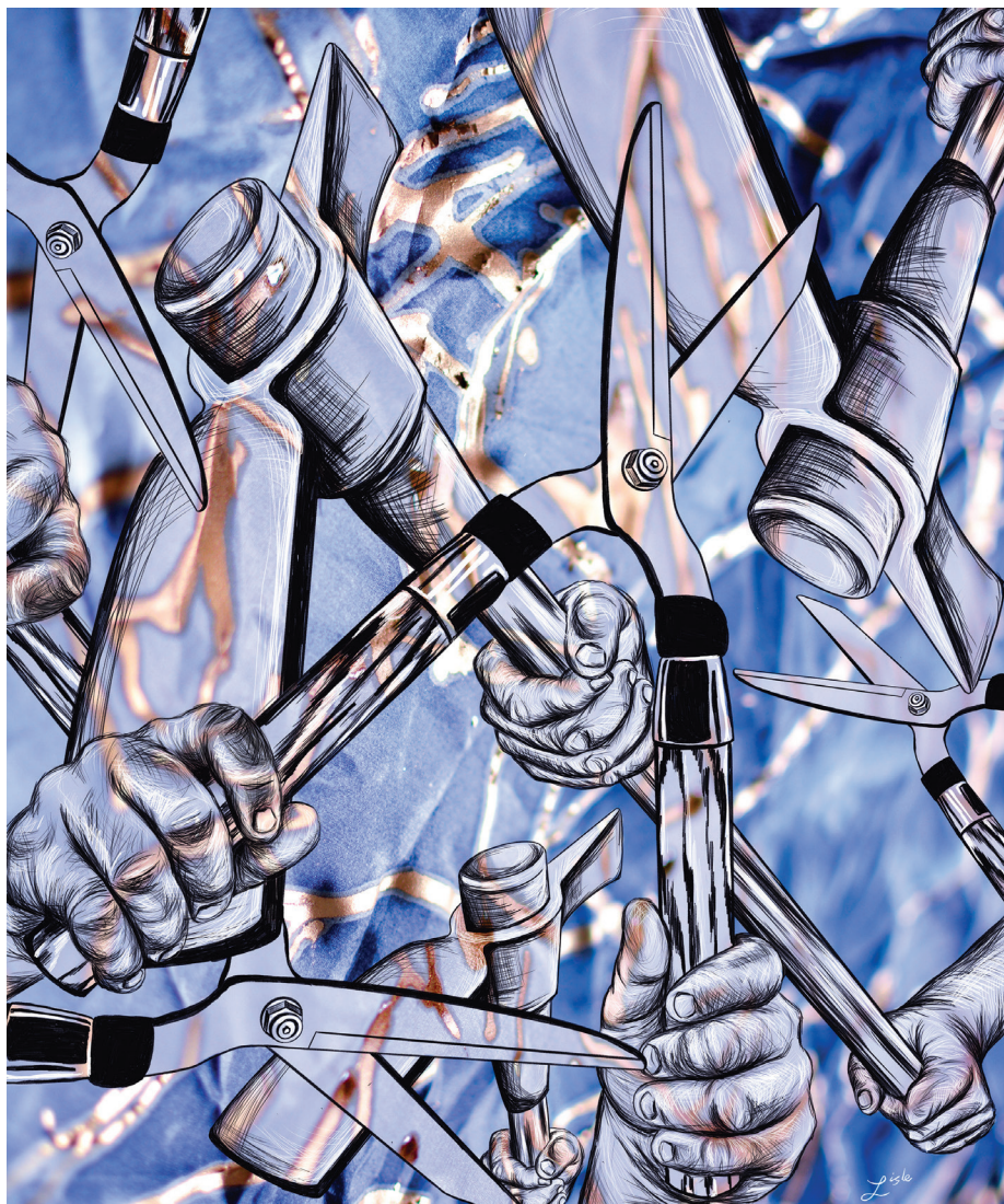
War No More | Lisle Gwynn Garrity Silk painting with digital drawing and collage