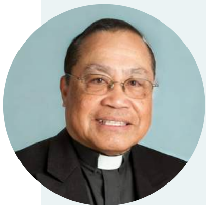
MONSIGNOR FLORO ARCAMO