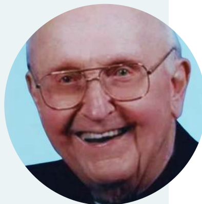
MONSIGNOR ALVAN HEURING