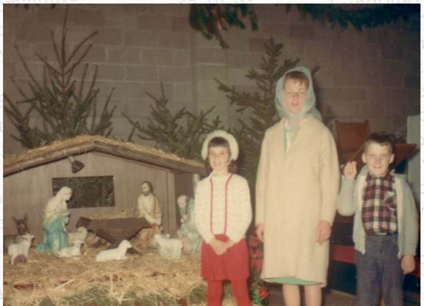
Celebrating Christmas in the 60's