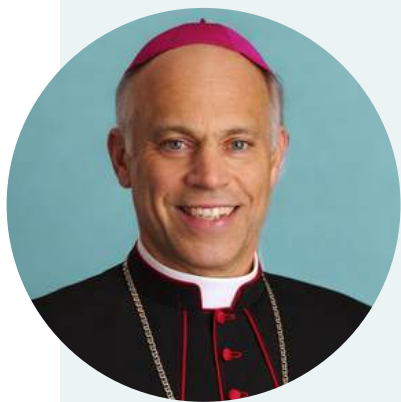
ARCHBISHOP SALVATORE CORDILEONE