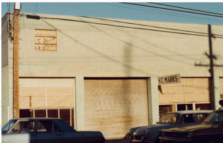
The garage at 785 Old County Road (circa 1965).