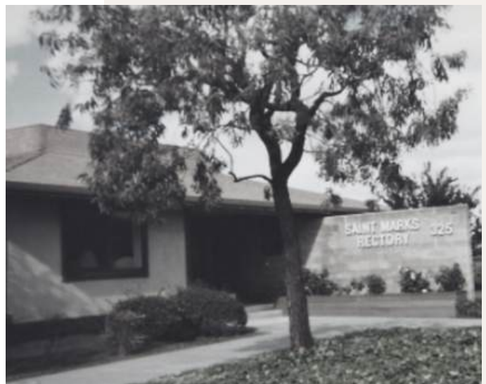
Clockwise from the top: Front exterior of Saint Mark Catholic Church built in 1971, the church interior, Saint Mark Rectory added in 1983, the Saint Mark chapel and the tabernacle in the chapel.