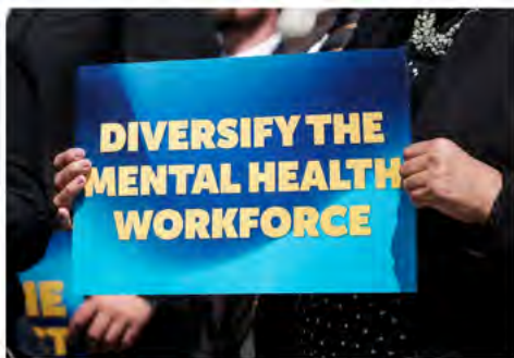
A mental health advocate holds a sign during a press conference on the proposed Mental Health Workforce Act April 19, 2024, on Capitol Hill in Washington. The nation's Catholic bishops on Sept. 15, 2025, launched new components of their National Catholic Mental Health Campaign: "Healing and Hope."

said. Testimonies shared in the Sanctuary Course and in documentaries such as My Ascension , which tells the story of a young woman who survived a suicide attempt, can help people relate in a way that encourages them to seek help, Abolins said.