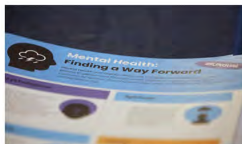
A booklet is pictured during a Jan. 28, 2023, lecture titled "Mental Health: Moving Past the Taboo to a Culture of Acceptance" at the Catholic Social Ministry Gathering in Washington.