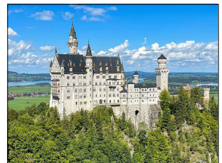
Neuschwanstein Fairy Tale Castle

Make your reservations as soon as possible to guarantee the group price!