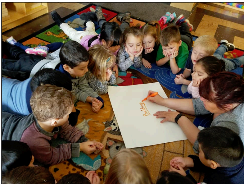
4 year-old preschoolers brainstorm what they already know and what they want to know about building bridges.

Thank you to all who helped sponsor this page!