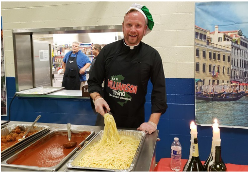
Our annual Italian Winterfest Dinner was a huge success with over 300 people attendance.