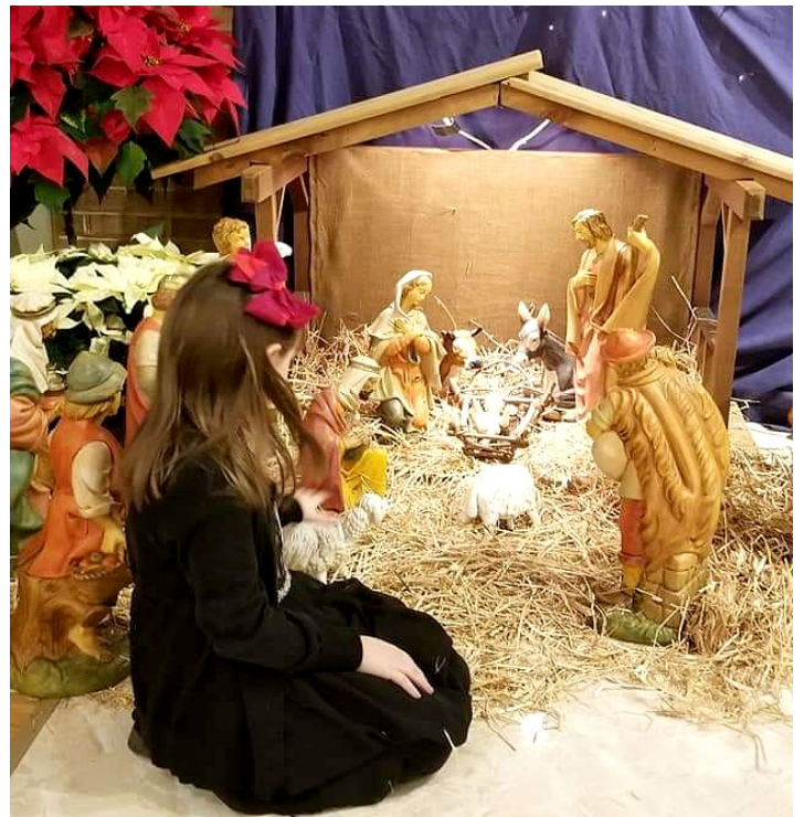
A young parishioner ponders the nativity at Ascension

As we enter into 2020, CCASTA has many successful events to remember — occasions we don't want to forget. Attendance was some times at record levels and parish engagement continues to rise as we seek to know Christ better, receive Him into our lives, and share him with others in our family and neighborhoods. Enjoy these pics of 2019 in no particular order.