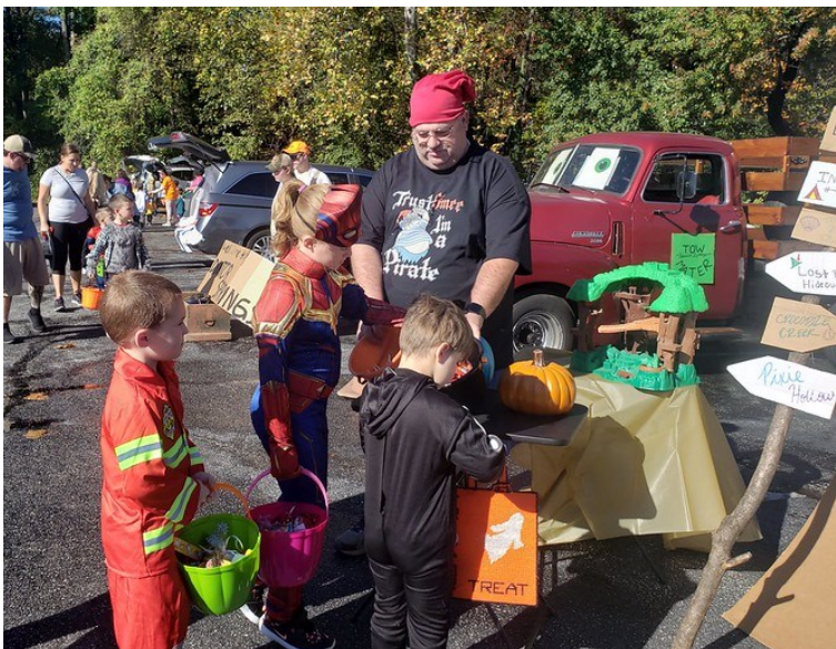
The weather turned out beautiful just in time for Trunk or Treat.