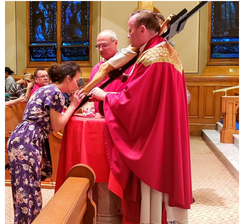
Veneration of the Cross during Lent

At the Easter Vigil, 9 members received Sacraments and were welcomed into the Church. Others joined throughout the year.