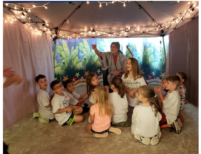
A special Vacation Bible School in July offered participants an in-depth look at St Paul, his life, and his teaching.