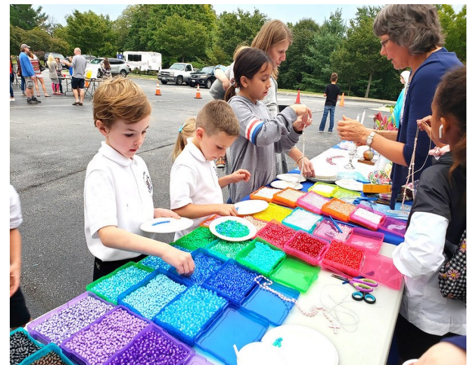
Our annual Tailgate Party in September hosted over 400 people of all ages.