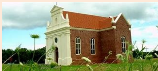
Brick Chapel – St. Mary's City