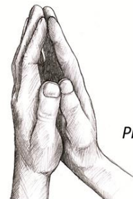
Praying hands flag