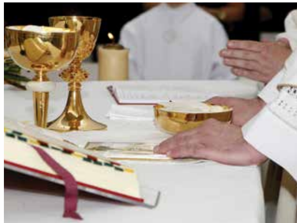
Hands of priest by the mass

Reflect on this passage. How do these words apply also to the Eucharist? How does the Eucharist manifest God's sweetness toward his children?