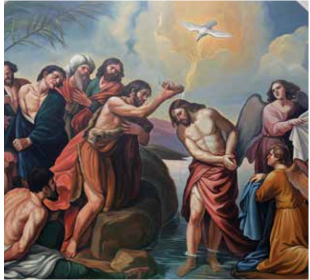
Baptism of the Lord

In the New Testament we find many references to water as well. Before he begins his public ministry, Jesus is baptized by John the Baptist in the Jordan River. In his first public miracle, Jesus turns water into wine at the wedding feast at Cana. On the cross, blood and water flow from Jesus' side when the soldier's spear pierces his chest.