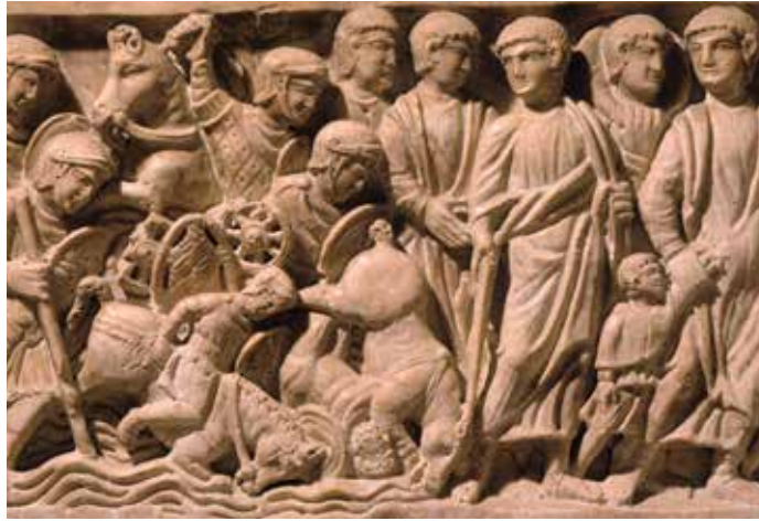
The Israelites Crossing the Red Sea. Roman sarcophagus / Berlin / Manastirne

When the Israelites, with their backs pinned against the Red Sea, see Pharaoh's army and charioteers driving toward them, they cry out to Moses in fear, who responds: