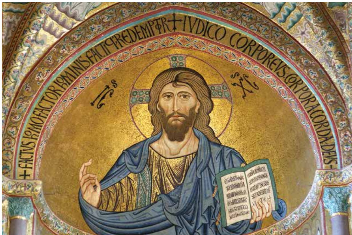
The Christ Pantokrator. Cathedral-Basilica of Cefalu

Moses was called to live a life of radical trust. We can be encouraged by his successes, and warned by his failure in Numbers 20. In what areas is God calling you to a more radical trust in him?