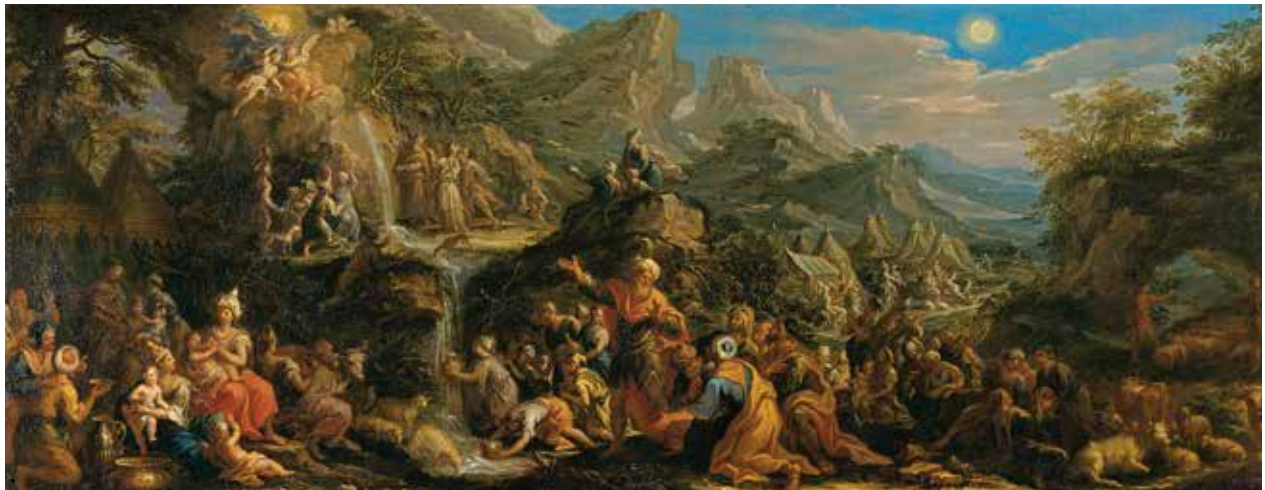
Moses drawing water from a rock

In Scripture, water is important both spiritually and physically. It is a sign of creation and rebirth. Abundant rains at the proper times are a sign of God's favor, while drought is one of the curses listed in Deuteronomy for breaking the covenant (see Deuteronomy 28:15–24). In a very real way, water holds the power of life and death.