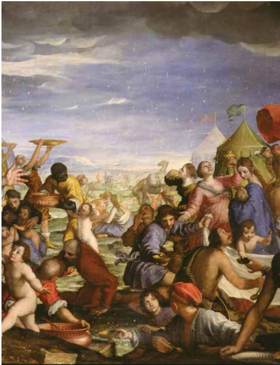
The Manna from Heaven

Pomponio Amalteo's The Manna from Heaven hangs today in the Civic Museum of Udine, northeast of Venice. Pomponio Amalteo was an Italian painter and part of the Venetian School that thrived from the mid-fifteenth to early-seventeenth century. During this time Venice was a major port and a prosperous republic, and the city was home to numerous artists, including sculptors, woodworkers, glassmakers, and painters.