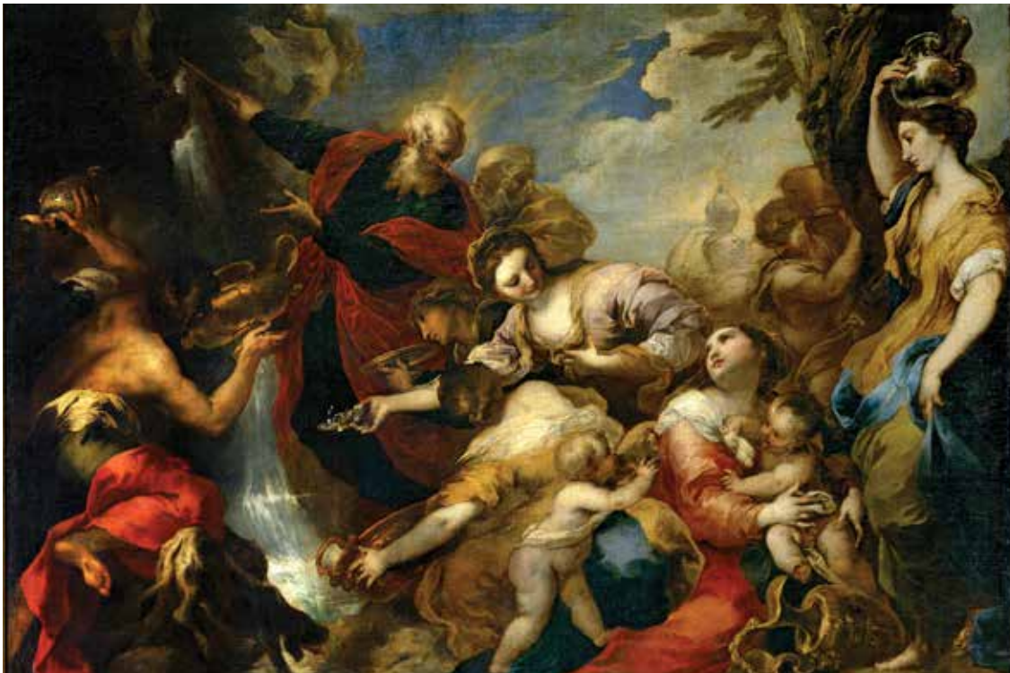
Moses drawing water from the rock