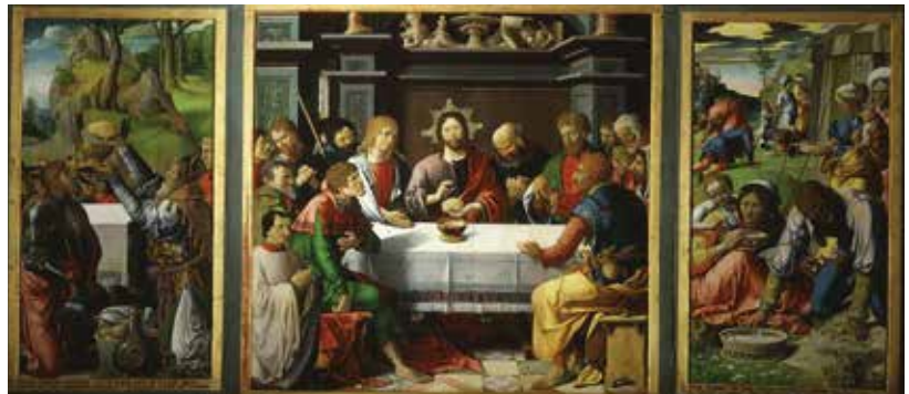
Melchisedech and Abraham offering the bread and wine, The Last Supper, Gathering the Manna

Welcome to the fourth session in our study of the Eucharist. In his preaching, Jesus speaks of himself as "the bread which comes down from heaven" (John 6:50). While many Catholics hear these words and automatically think of the Eucharist, what came to mind for the Jews to whom Jesus first preached these words?