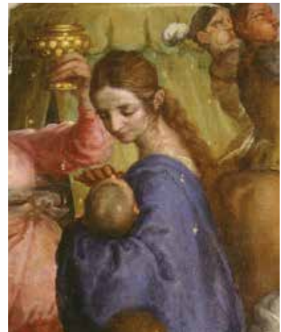
The Manna from Heaven

The crowd collecting manna includes naked children, and men and woman of all ages dressed in robes of a multitude of subtle, rich colors. On the right side of the picture stands a woman robed in a deep, vibrant blue holding her infant closely, lovingly looking into the infant’s face. The mother almost looks as if she might be feeding her infant. This mother’s tender care of her child is a beautiful image of the loving attention with which God cares for his children, Israel, as he feeds them with the bread of angels. Additionally, this “woman and child” mingled among God’s people hints to the viewer of the messiah that God will send to be the true bread from heaven.