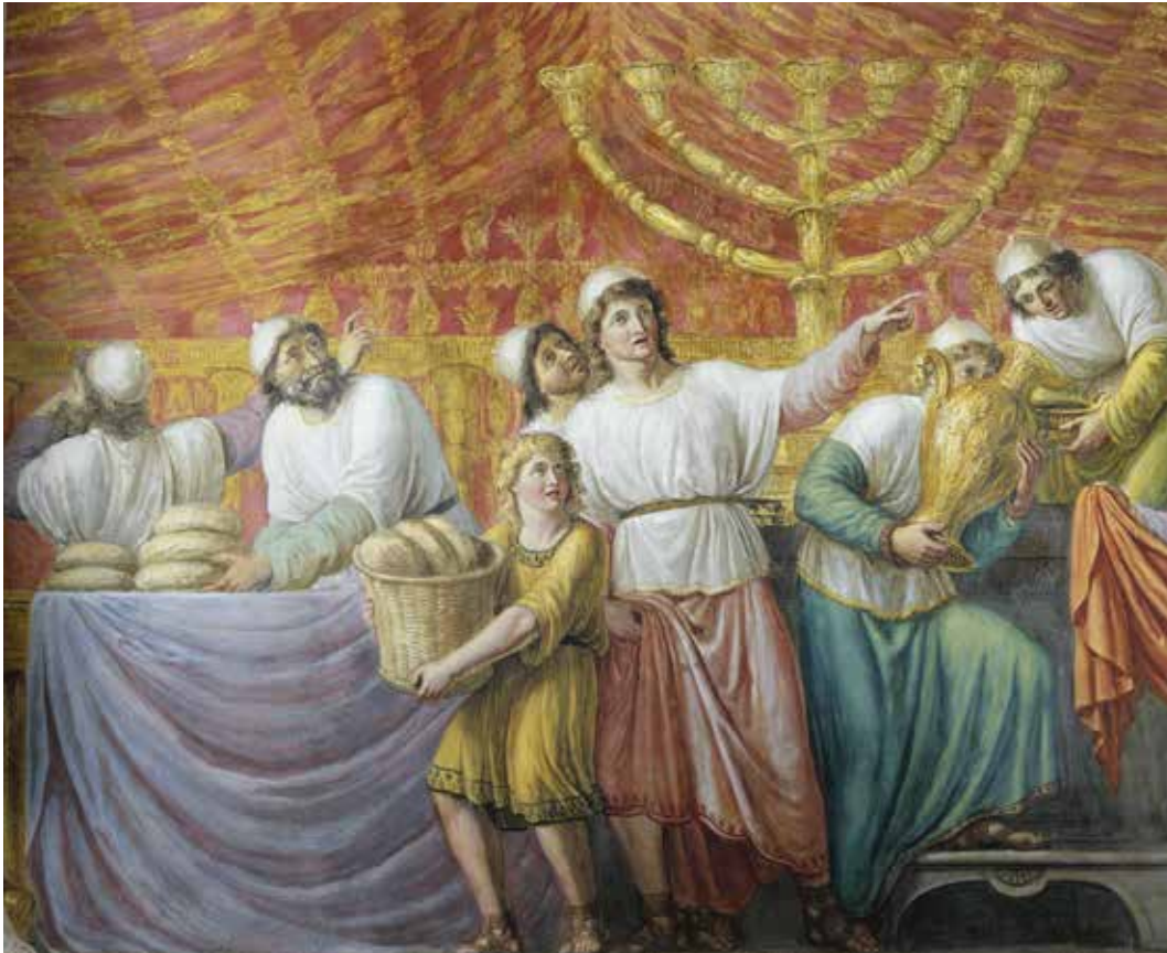
'Preparation of a Hebraic feast'

Isaiah's prophecy of a great banquet recalls several key meals in the Old Testament. First, the Passover meal in Exodus 12, which not only spared Israel from the angel of death, but also anticipated the victorious release of God's people from slavery in Egypt. Exodus 12:11 called this meal "the LORD's Passover," indicating that God himself was the host. Second, the covenant meal in Exodus 24, where Moses, Aaron, Nadab, Abi'hu, and the seventy elders of Israel beheld God, and ate and drank. This meal took place not in Egypt, like the first Passover, but "on the mountain," this time on Mount Sinai. Third, it recalls the provision of the miraculous food and drink in the desert, where God provides "food in abundance" for his people—manna, quail, and water from the rock—feeding them with "the bread of the angels" that provided "every pleasure and [was] suited to every taste" (see Psalm 78:23–25 and Wisdom 16:20).