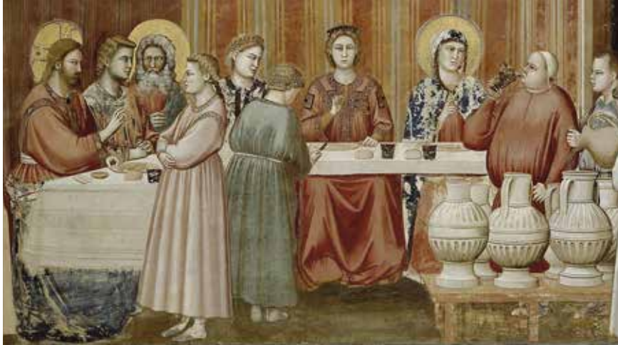
Wedding at Cana, Scrovegni Chapel, Padua, Italy

At the wedding at Cana, Mary perceives a need and intercedes. She places her faith in her Son and entrusts the rest to him. As St. John Paul II once reflected, “Faced with the lack of wine, Mary could have sought some human solution to the problem at hand, but she does not hesitate to turn immediately to Jesus: ‘They have no wine’ (John 2:3).” Let’s turn with Mary to Jesus in his Word in the Gospel of John.