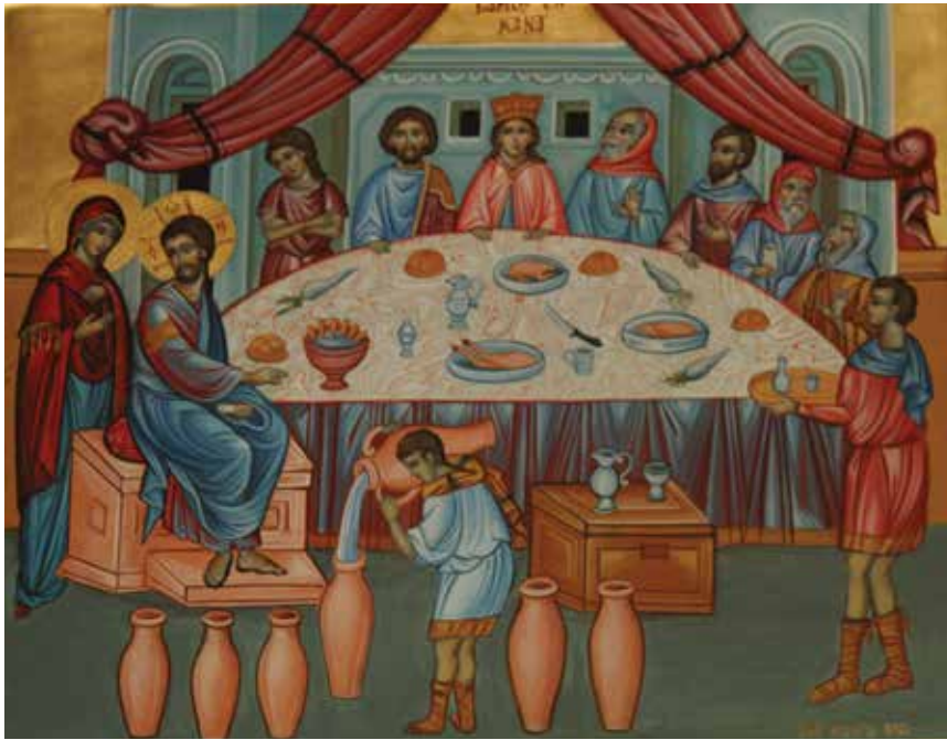
The Marriage at Cana

Mary's words at the wedding in Cana, "They have no wine," not only reveal a need at that wedding, but also recall Isaiah's prophecy and the Jewish anticipation of the Lord's provision of the finest wine. While Jesus steps in for the groom at Cana and provides a superabundance of the best wine for the couple and their guests, it will not be until his "hour has come" that he fully takes on the role of the Bridegroom