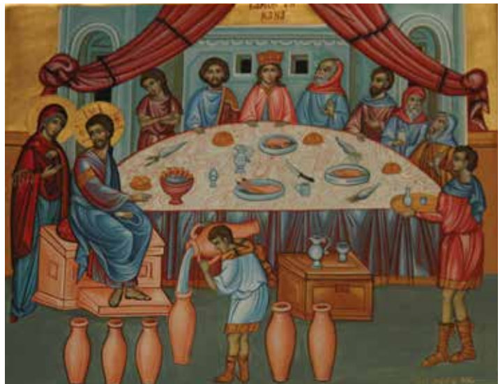
The Marriage at Cana photo / Augustine Institute / All rights reserved.

In this session we turn from the Old Testament to the pages of the New Testament, and we begin to look at the words and deeds of Jesus during his public ministry. We'll review several miracles in the Gospels that not only display Jesus' divine power, but that could also be referred to as Eucharistic miracles—miracles that anticipate Jesus' gift of the Eucharist. But how do wedding feasts and bread fragments point forward to the Last Supper? Let's find out.