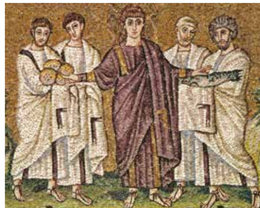
Multiplication of the loaves and fish

If the multiplication of the loaves and fishes reminds us of the first Exodus and helps to reveal Jesus as the “new Moses,” then we should expect a “new exodus.” But rather than an exodus that saves from physical slavery, this new exodus would save God’s people, each of us, from our slavery to sin. This is what Jesus does—saves us from our sin and feeds us with the bread of angels. God writes signs into history (Moses, the Exodus from slavery, manna, etc.) and then fulfills them in his Son (Jesus the new Moses, exodus from sin through baptism, multiplication of bread and ultimately feeding us with the Eucharist) so that we won’t miss all that he has done out of love for us, and so that we might have faith and turn in love to him.