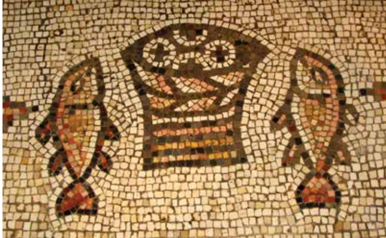
Ancient mosaic inside the Church of the Multiplication of the Loaves and the Fishes, Tabgha, Israel

There are numerous times throughout the gospels that the disciples did not understand Jesus' work, actions, or teaching. Jesus often had to sit down with them to reveal the deeper meaning of his parables (see Matthew 13:36), or, for example, to explain why they were unable to heal the epileptic (see Matthew 17:13–20).