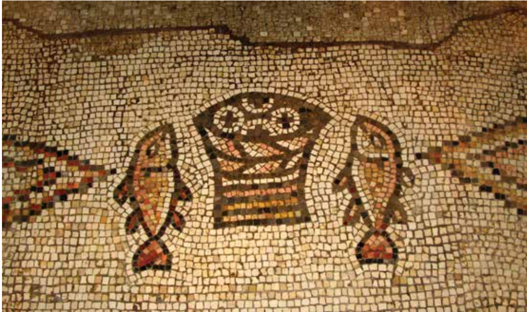
Ancient mosaic inside the Church of the Multiplication of the Loaves and the Fishes, Tabgha, Israel

In the Holy Land, the Church of the Multiplication is located along the northwest shore of the Sea of Galilee in the area known as Tabgha, just a mile and a half west of the city of Capernaum. The location's name, Tabgha, is an Arabic corruption of the older Greek name Heptapegon , meaning seven springs. The area along the northwest shore of the Sea of Galilee was known for its many warm springs, which fed the sea and attracted fish in the cold months of the year. Along the short distance of this northwest shore of the Sea of Galilee, Jesus healed the paralytic, preached the Sermon on the Mount, broke bread with his disciples after his resurrection, and multiplied loaves and fish to feed a multitude. From early on, Christians venerated each of these locations. At Tabgha, this included venerating the very rock on which Jesus placed the loaves and fish.