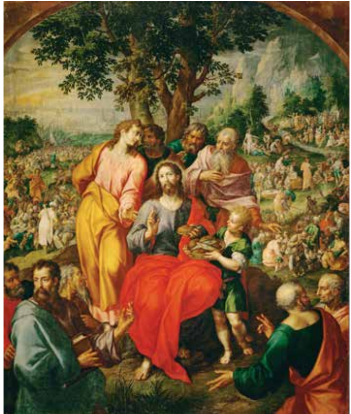
The Feeding of the Five Thousand / Erich Lessing / Art Resource, NY

Let's take a look at some of the similarities between the feeding with manna and Jesus' feeding of the five thousand. Answer the following questions in the chart on the next page.