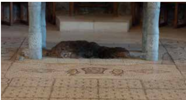
The Church of the Multiplication of the Loaves and the Fishes

While it is impossible to know the exact intent of the artist, the mosaic's location in the church can give us a clue as to the missing fifth loaf in the mosaic's basket. The mosaic is located just before the rock that is venerated as the place where Jesus placed the five loaves and two fish. Over this rock, and incorporated to it, is the church's altar. It is upon this altar that bread will be laid for the Eucharistic celebration. Could the missing loaf in the mosaic be the loaf that will be placed upon the altar and changed into the body of Christ?