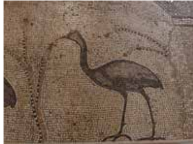
The Church of the Multiplication of the Loaves and the Fishes, Tabgha, Israel

Over the centuries, several feet of silt and dirt covered the remains of these early sanctuaries. It was not until archeological excavations in 1932 that this debris was removed to reveal the remains of these earlier churches. Then in the 1980s, a new church was built to the Byzantine form, incorporating portions of the original exquisite fifth-century mosaics. But the most cherished was the humble mosaic of the loaves and fishes.