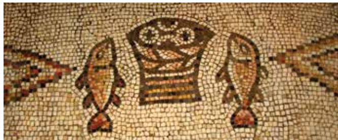
Ancient mosaic inside the Church of the Multiplication of the Loaves and the Fishes, Tabgha, Israel