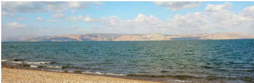
Sea of Galilee in the early morning, ripples on the water and clouds in the sky

In the Holy Land, the Church of the Multiplication is located along the northwest shore of the Sea of Galilee in the area known as Tabgha, just a mile and a half west of the city of Capernaum. The location's name, Tabgha, is an Arabic corruption of the older Greek name Heptapegon , meaning seven springs. The area along the northwest shore of the Sea of Galilee was known for its many warm springs, which fed the sea and attracted fish in the cold months of the year. Along the short distance of this northwest shore of the Sea of Galilee, Jesus healed the paralytic, preached the Sermon on the Mount, broke bread with his disciples after his resurrection, and multiplied loaves and fish to feed a multitude. From early on, Christians venerated each of these locations. At Tabgha, this included venerating the very rock on which Jesus placed the loaves and fish.