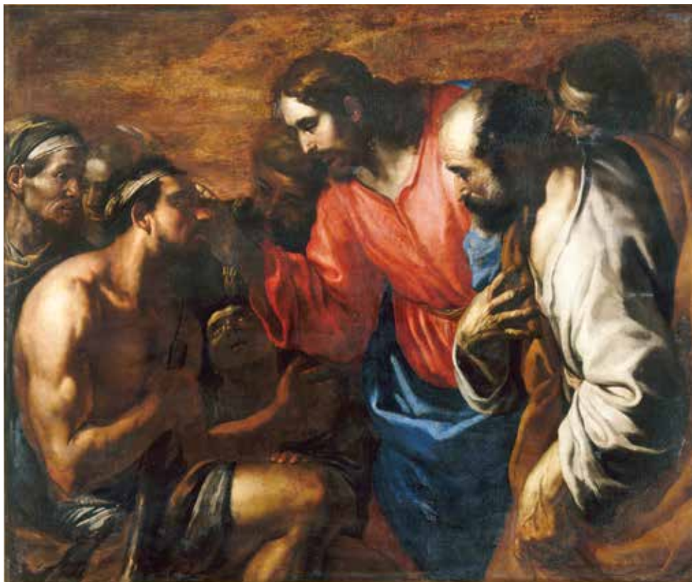
Christ healing the blind

The disciples are not physically blind, but they are spiritually blind. And as if to drive home the message of their blindness, in the very next scene of Mark's gospel, Jesus will heal a blind man. Read Mark 8:22–25. The blind man in this account isn't healed with a simple command of Jesus. What does it take for this man to regain his sight?