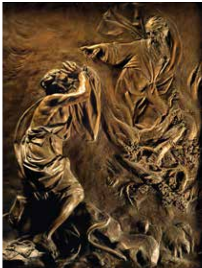
Moses and the burning bush

At the time of Jesus' birth, the situation of the Jews seemed rather dismal. Though they were no longer in exile, they remained subject to the Roman Empire. The Romans tolerated the Jews and their way of life, allowing their Temple system and traditions to continue relatively unaffected as long as taxes were paid. For the Jews, however, this was less than ideal. They had no viable king from the line of David, no political independence, and no return of the presence of God to the Temple.