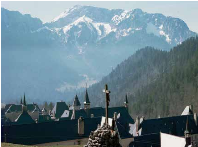
Carthusian Monastery

The Church offers us an answer to this in the ancient tradition of lectio divina in which, as the Catechism says, “The Word of God is so read and meditated that it becomes prayer” (CCC 1177). For nearly a millennia lectio divina has been practiced according to the four simple steps of Guigo’s ladder.