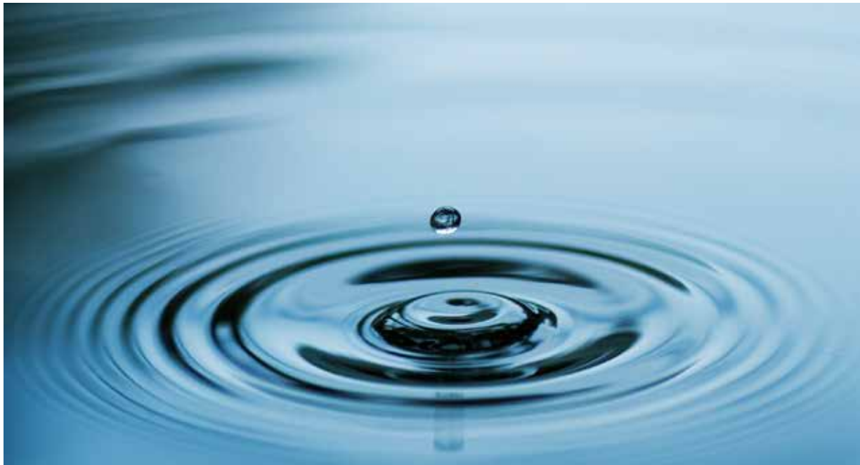
Droplet falling in blue water

Prayer isn't always going to go as expected—just as the Samaritan woman didn't expect to meet Jesus at the well, or for him to tell her “all that I ever did.” Prayer is almost guaranteed to be inconvenient sometimes, and it may even be uncomfortable. But it is always worth it! In prayer God continues to pour out on us the abundant gift of his Spirit. Like living water the Holy Spirit is life-giving and refreshing, enabling us to thrive, not just survive.