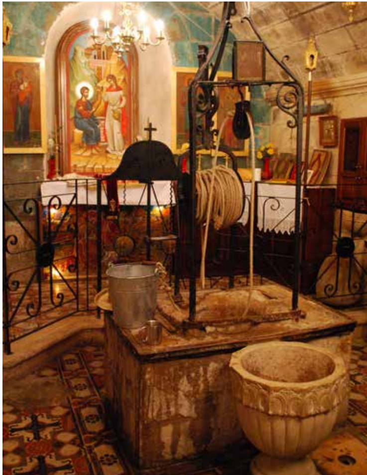
Jacob's Well, Holy Land © Augustine Institute photo. All rights reserved.

ORATIO, CONTEMPLATIO, RESOLUTIO: Having read and meditated on today's Scripture passage, take some time to bring your thoughts to God ( oratio ) and engage God in silence ( contemplatio ). Then end your prayer by making a simple concrete resolution ( resolutio ) to respond to God's prompting of your heart in today's prayer.