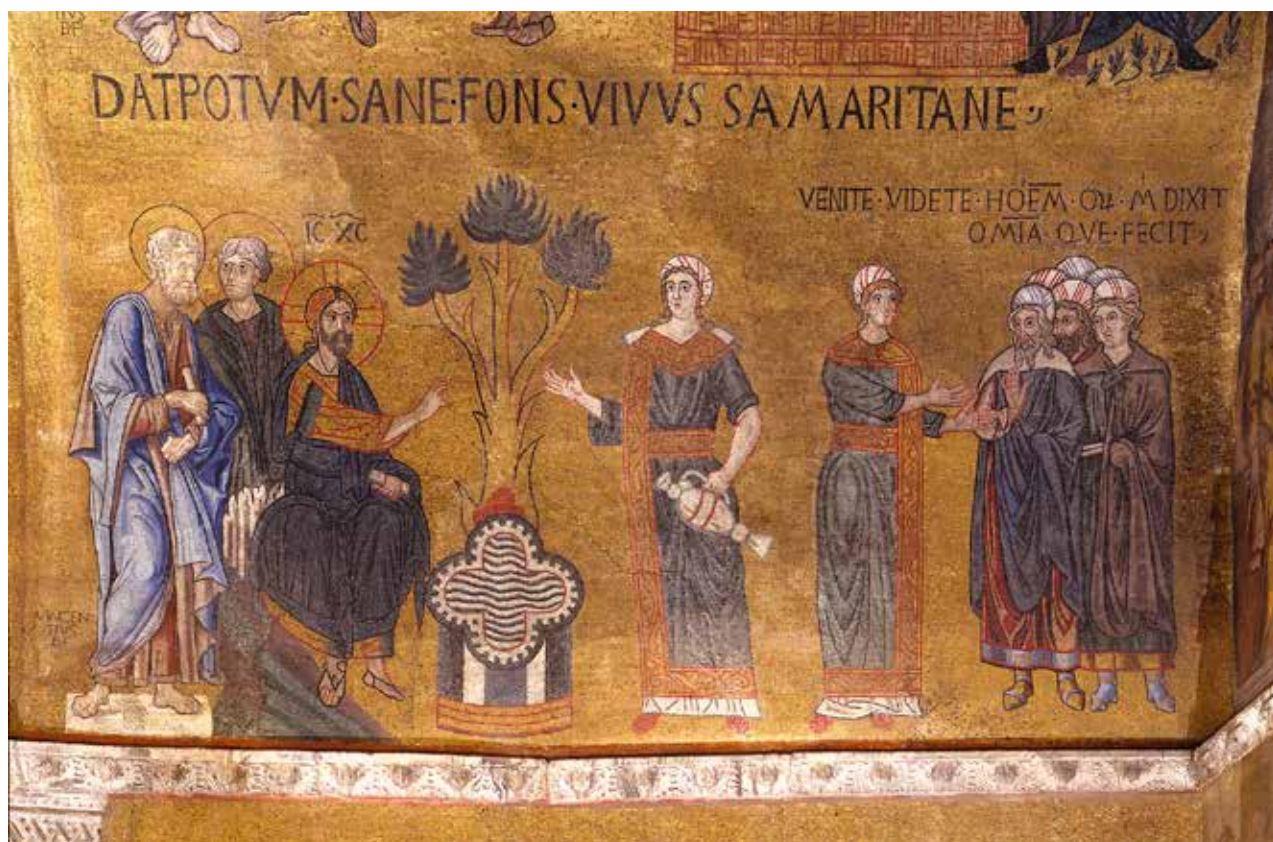
Christ and the Samaritan Woman at the Well

Christ and the Samaritan Woman at the Well, Byzantine Mosaic, Basilica of San Marco, Venice, Italy