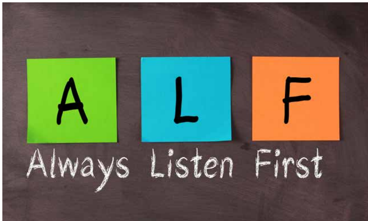
Always Listen First (ALF)

God won't let anything get in the way of drawing close to us in prayer. What is getting in your way of listening and responding?