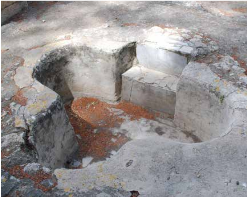
5th century remains of baptistery at Emmaus-Nicopoli

At the top of the scene, the Latin inscription “ Dat Potum Sane Fons Vivus Samaritine ” proclaims: “A living fountain gives a drink healthily to the Samaritan.” While the Latin “ sane ” could be translated as “discreetly,” which also applies as the Apostles were initially away when Jesus first encounters the Samaritan woman, “healthily” gives a sense of the healing and spiritual restoration that happens in the woman’s life as a result of her encounter with Jesus.