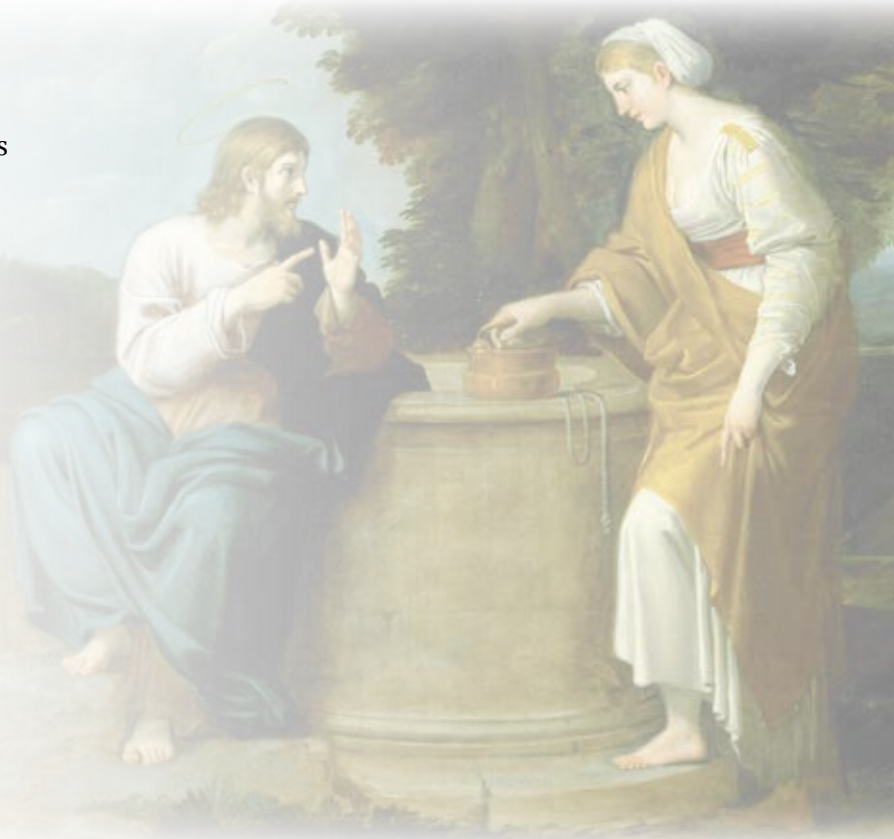
Christ and the Samaritan Woman at the Well

Lord Jesus Christ, you continually invite us into a deeper encounter with you. May we always respond eagerly to your invitation. As we receive from you the gift of living water in prayer, may our hearts and our lives be transformed to reflect your glory. Amen.