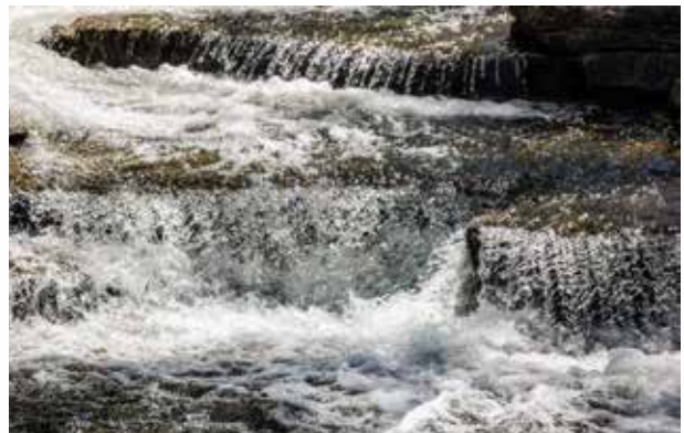
Water Flowing over Creek Rocks

The Old Testament prophet Jeremiah records God’s lament over the unfaithfulness of his people, Israel: “For my people have committed two evils: they have forsaken me, the fountain of living waters, and hewed out cisterns for themselves, broken cisterns, that can hold no water” (Jeremiah 2:13). The people had forsaken God and his law. They had “changed their glory for that which does not profit” (2:11) and were worshipping false gods and not living according to God’s ways.