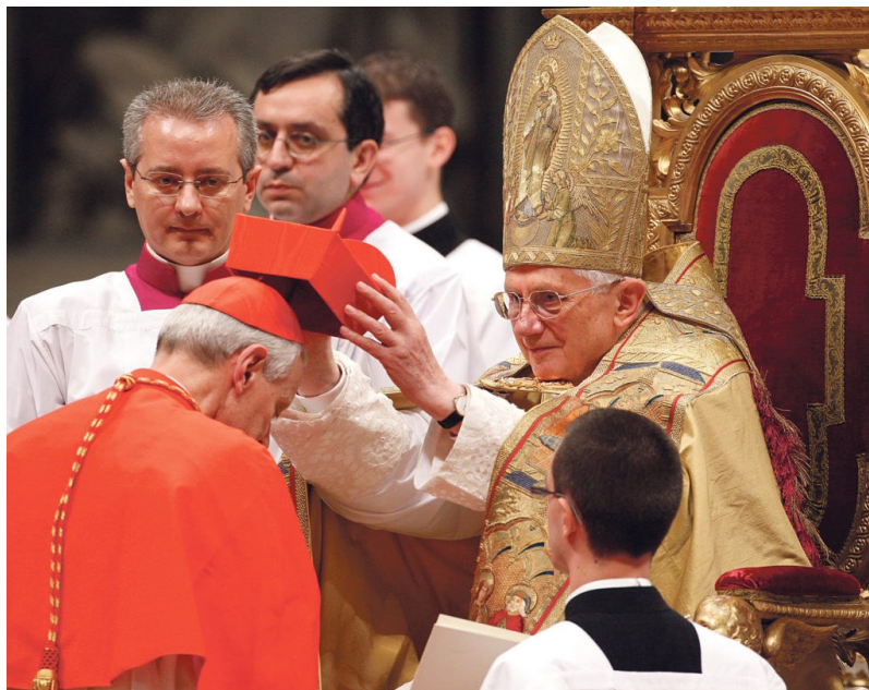
Pope Benedict installs Archbishop Wuerl of Washington as a new cardinal on November 20, 2010 .

What is a cardinal, exactly, and what role do they play in the leadership of the Church? First, a little history. The word "cardinal" comes from the Latin word cardo , a hinge or pivot. So "cardinal" in this sense means the place that other things revolve around, i.e., the main or principle item. Think, for instance, of the four "cardinal points" or a compass, north-south-east-west, from which all the other directions derive their meaning. In the early days of Christianity, certain churches in Rome were called "cardinal churches"; these were the big basilicas and pilgrimage destinations, which were the principle churches in the city. Those in charge of these churches in turn became "principle" pastors in the presbyterate of Rome. So when the pope - the bishop of Rome - needed counsel on matters facing the Church, he would turn to these pastors to solicit their advice. Hence, these priests and deacons became the pope's "cardinals".