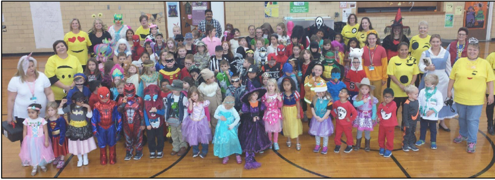
A "spooky" school community!!!