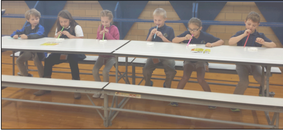
1 st graders blow marshmallows across a table using straws during 60 Seconds to SHIELD at Wednesday's assembly.