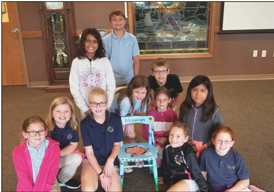
4 th graders pose with the chair they created as 3 rd graders to be sold at the Fall Fest auction on Sunday.

For further clarification of this, please refer to p. 12 of the 2018-2019 SJS Student/Parent Handbook found on the parish/school website https://stjameschool.pvt.k12.ia.us