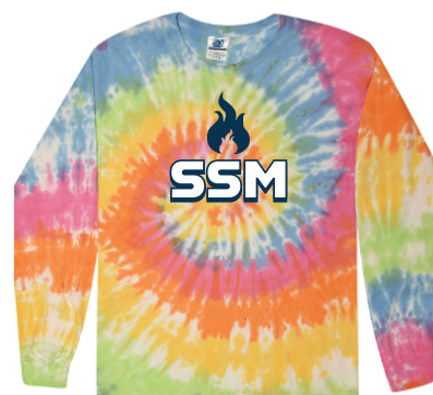
Design #4 tie-dye

(available in hoodie, & short and long sleeve T)