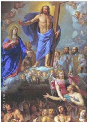
Prayer for the Souls in Purgatory

O gentle Heart of Jesus, ever present in the Blessed Sacrament, ever consumed with burning love for the poor captive souls in Purgatory, have mercy on them. Be not severe in Your judgements, but let some drops of Your Precious Blood fall upon the devouring flames. And, Merciful Savior, send Your angels to conduct them to a place of refreshment, light and peace. Amen.