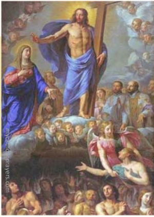
Prayer for the Souls in Purgatory By St. Gertrude

Eternal Father, I offer Thee the Most Precious Blood of Thy Divine Son, Jesus, in union with the masses said throughout the world today, for all the holy souls in purgatory, for sinners everywhere, for sinners in the universal church, for those in my own home and within my family. Amen.