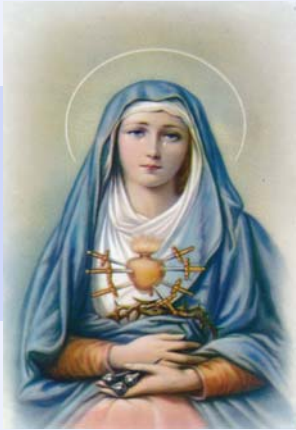
The Seven Sorrows of Mary