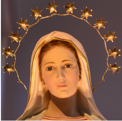
Our Lady of Tihaljina

Son more deeply. Join us on a pilgrimage to this miraculous place.