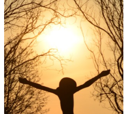
Statue of the Risen Christ

Medjugorje /med-ju-gor-ē-ə/ will shower you with innumerable gifts of the Holy Spirit. You will enjoy praying daily Mass more than ever. Adoration, Veneration of the Cross, and the Rosary may bring you to tears. The peace is so strong, you can feel the closeness of God. Our Lady is calling each of us to Medjugorje to know her