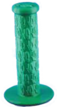
Flexible Hand Grip