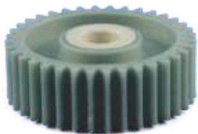
Multi-material gear printed with IGUS Iglide & ABS