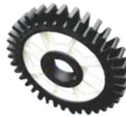
Multi-color & Material