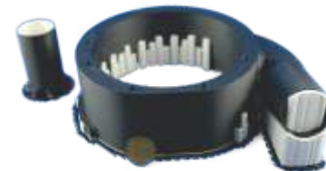
Soluble Support Material