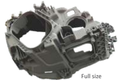
Full size Automotive Headlight Bucket