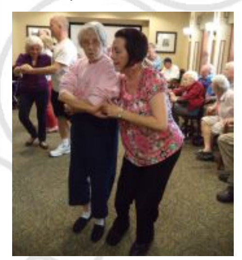
Peggy cut a rug with Phyllis