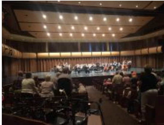
GR Symphony recognizing our Veterans!