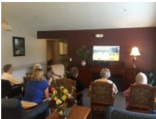
Beachside Wii Bowling