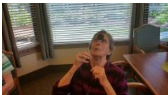
Face the Cookie Challenge: The goal is to use your facial muscles to move the cookie to your mouth from your forehead!