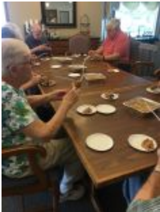
Making Bird Feeders