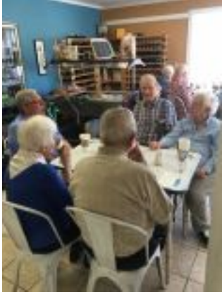
JK Bakery for Coffee and Donuts