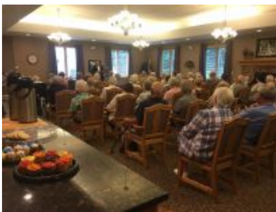
Birthday Party with Live Entertainment at Sandy Cove