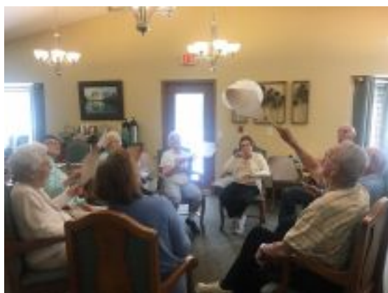
Driftwood Balloon Baseball