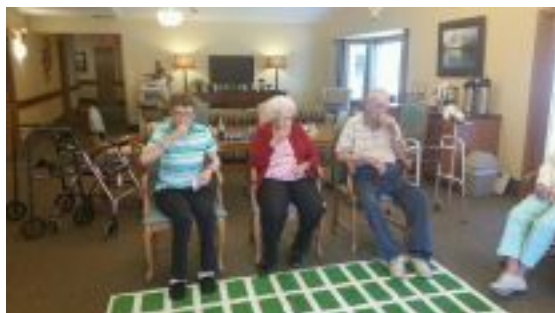
Seed Spitting Olympic Contest