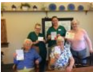
Making Cards for People in Need