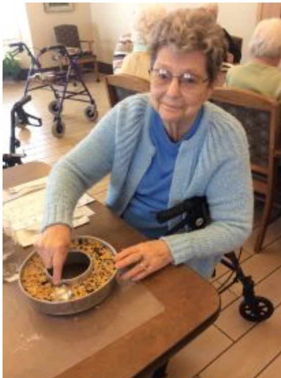
Molding a wreath of birdseed for the birds during the winter.