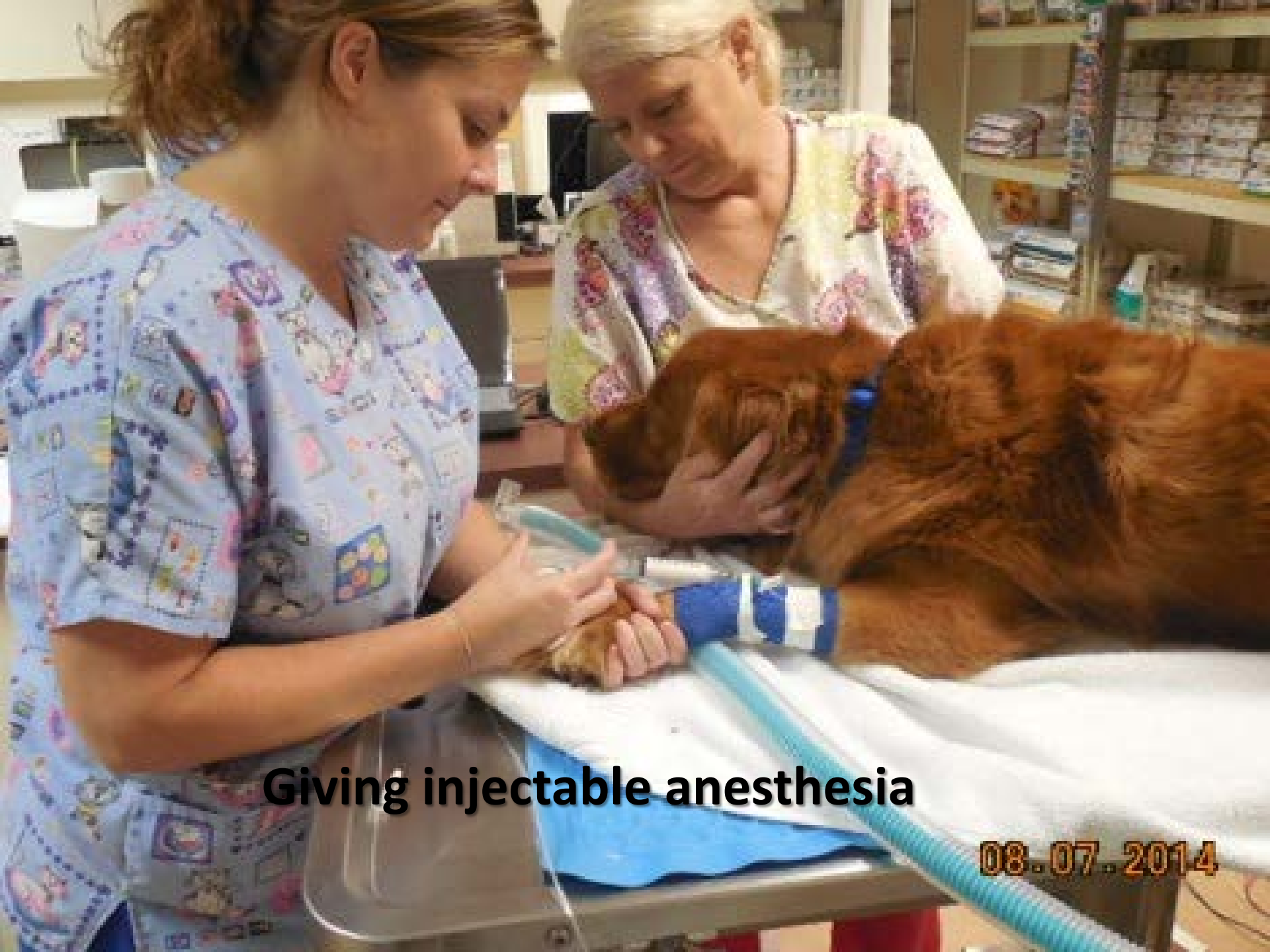
Giving injectable anesthesia